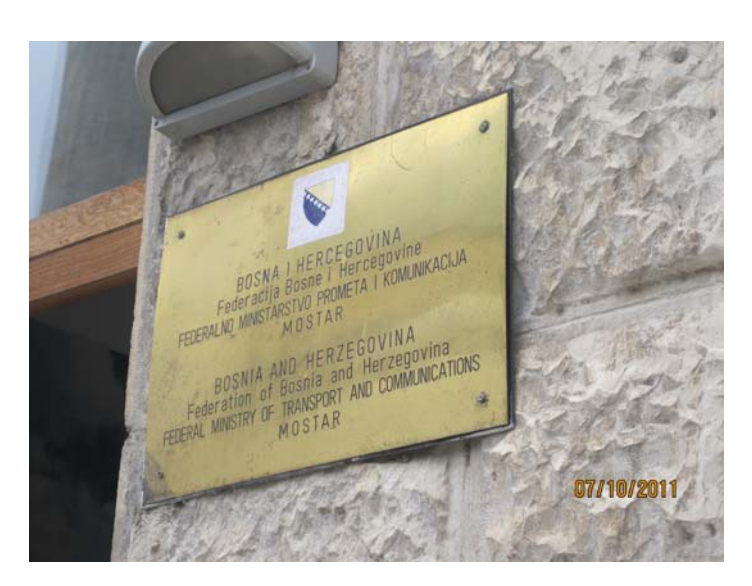
Figure 3. English language even on government signs.

After English the next most frequent foreign languages in Mostar are Italian, German and French, both at the eastern and western side of the city. These European languages have only but slight presence in the linguistic landscape of Mostar. They seem to enjoy a prestige in the domain of marketing. They are carriers of