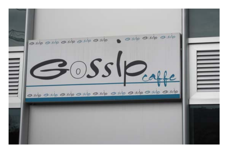
Figure 2. English language in the name of a coffee shop.

recent phenomenon. In the eastern part the percentage of the presence of the English language on signs is also high (52,2%), but not as surprisingly high as in the western part of the city.