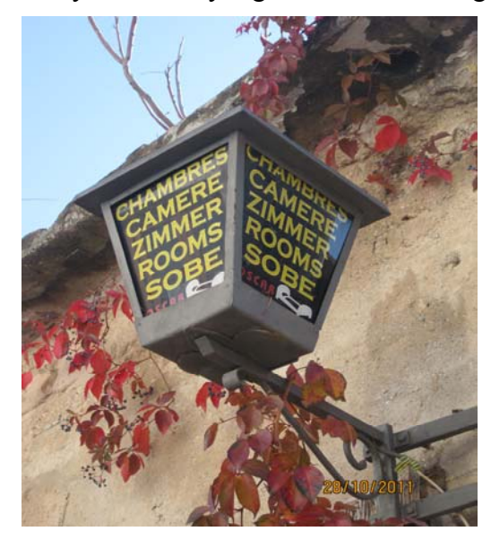
Figure 3. A multilingual sign in the Old Town.

From the table 3 it is clear that most of the signs, in both parts of the city, are monolingual. Approximately 38 percent of the signs contain more than one language. If we compare this result with the results of similar studies elsewhere, for example with the comparable study in Amsterdam (Edelman, 2010), where the ratio of monolingual and multilingual signs was 73:27, we can come up with a conclusion that Mostar is a city with a very high level of multilingualism.