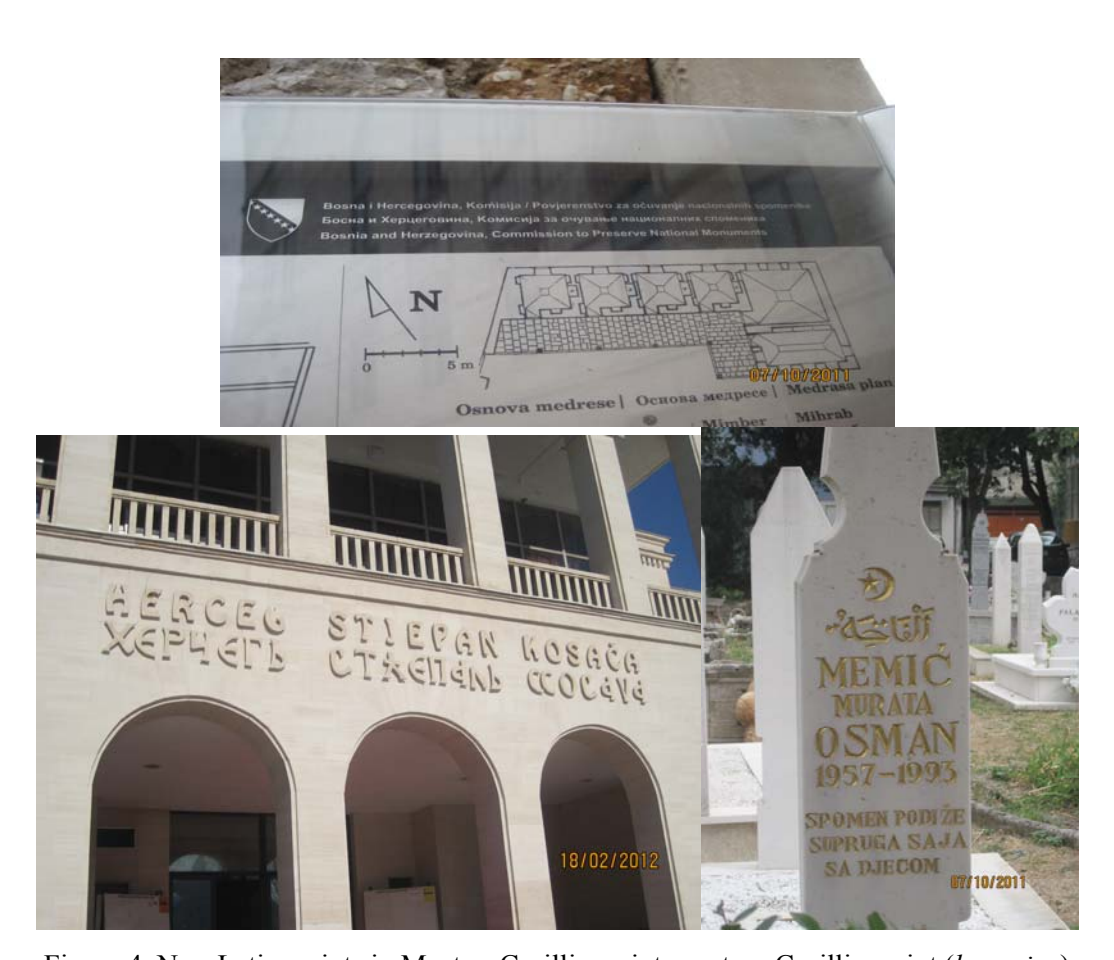
Figure 4. Non-Latin scripts in Mostar: Cyrillic script, western Cyrillic script (bosanica) and Arabic script, symbolic functions.

The order of appearance of the languages on signs and font size of the texts in different languages speak for themselves about the importance and relations among the languages in a speech community. The results have shown that in the western part of the city three most frequent and graphically largest languages are English, Croatian and Italian, whereas in the eastern part of the city Bosniak, English and French appear to be the most frequent and the largest.