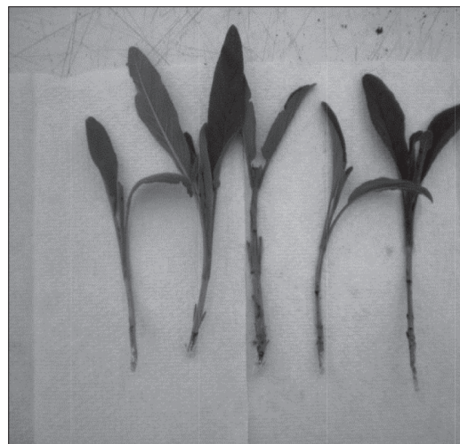
Figure 2. Sage cutting (Photo: Marić, M., 2012) Slika 2. Reznica kadulje (foto: Marić, M., 2012.)

Afterwards, plant cuttings were treated with the rooting powder Rhizopon I® containing rooting powder auxin IBA (indol-butyric acid 0,5%) (variant A2) and planted in substrate or cuttings were planted in substrate without being treated with rooting powder (variant A1). Plants were planted at the beginning of April in 9 cm diameter plastic pots filled with commercial substrate Fruhstorfer Erde - Aussaat und Stecklingserde (Hawita EU, Deutschland). Plants were irrigated regularly by hand depending on weather conditions and development stage of plants. The average daily air temperature during rooting period of the investigated plants ranged from