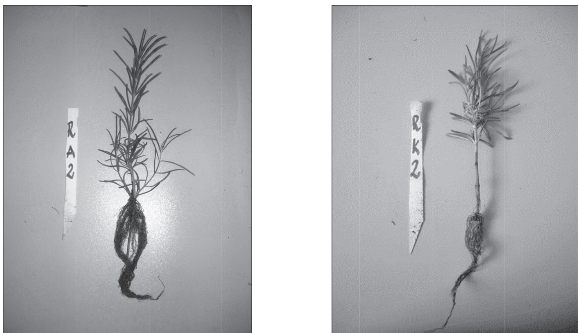
Figure 3. Development of treated with hormone (RA2) and untreated (RK2) cuttings of R. officinalis

Further, the highest average height of rosemary was 7.79 cm recorded on treated plants and was significantly higher compared to the control plants where average recorded height was 6.35 cm. Root length of the both investigated species was also under significant influence of rooting powder treatment ( P \leq 0.05 ).