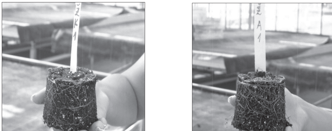
Figure 4. Root development of treated with hormone (ŽA2) and untreated (ŽK2) cuttings of S. officinalis

Slika 4. Usporedba razvijenosti korijena tretiranih renica (ŽA2) S. officinalis s hormonom i netretiranih (ŽK2)