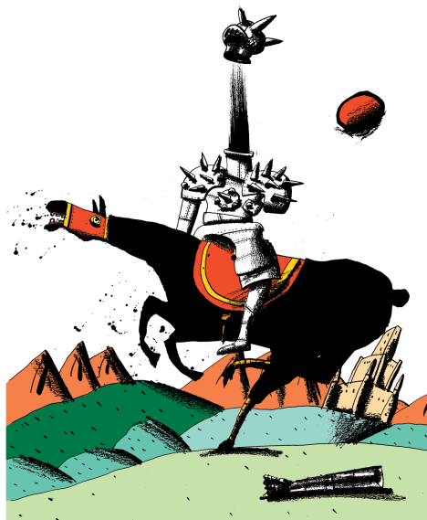
Illustration © Federico Maggioni