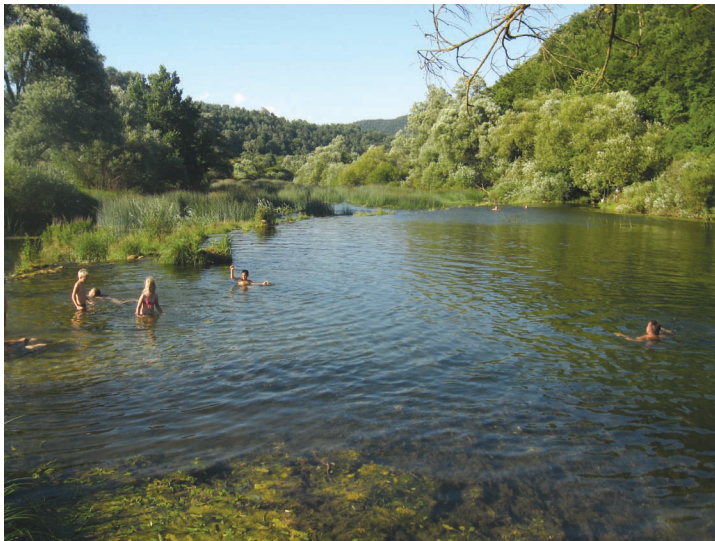
Fig. 3. The Korana River near Koranska Strana (site No. 7).