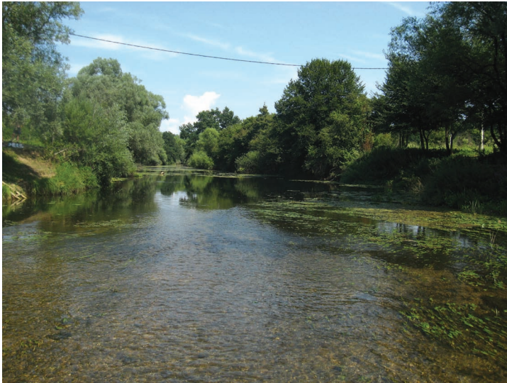
Fig. 2. The Korana River near Salopek Luke (site No. 5).