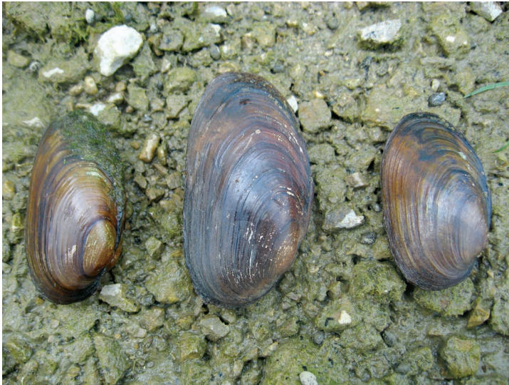
Fig. 6. Living individuals of Unio crassus (site No. 5).

3 – 44°58'32"N, 15°47'00"E, Tržačka Raštela, the Korana River at Tržačka on the boundary between Croatia and Bosnia and Herzegovina, 7.7.2012;