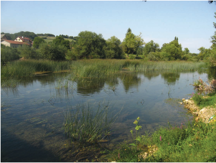
Fig. 4. The Korana River at Barilovič (site No. 9).