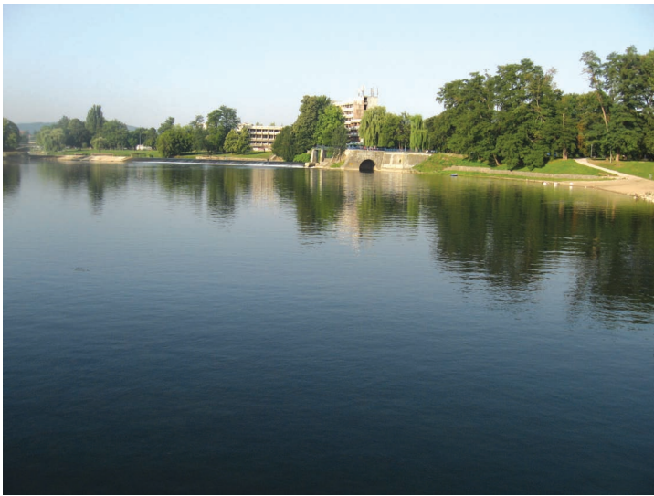
Fig. 5. The Korana River at Karlovac (site No. 13).

1 – 44°54'35"N, 15°36'28"E, Rastovača, the Korana River on the southern edge of the Plitvice Lakes NP, 15.8.2009;