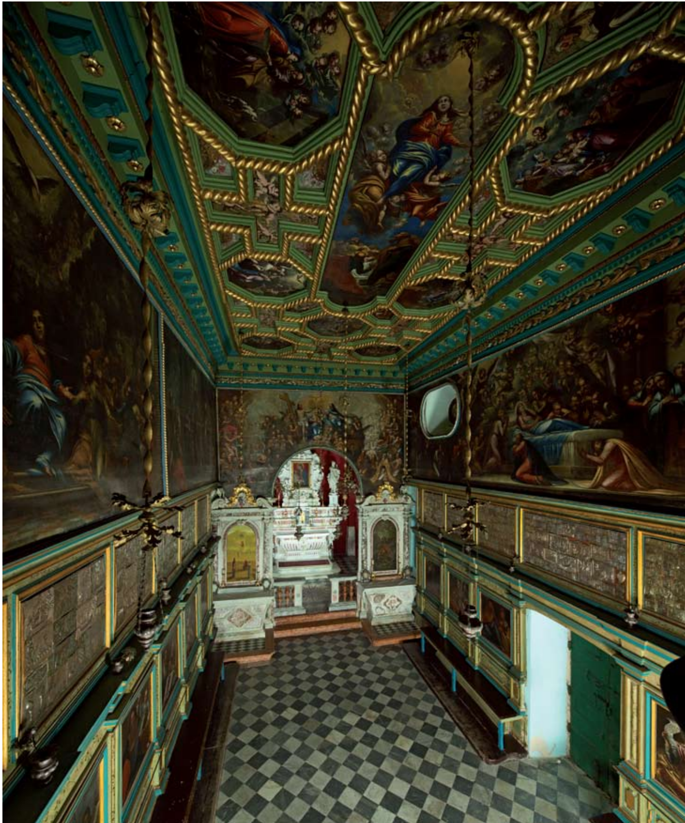
Crkva Gospe od Škrpjela, unutrašnjost, pogled prema svetištu, Perast