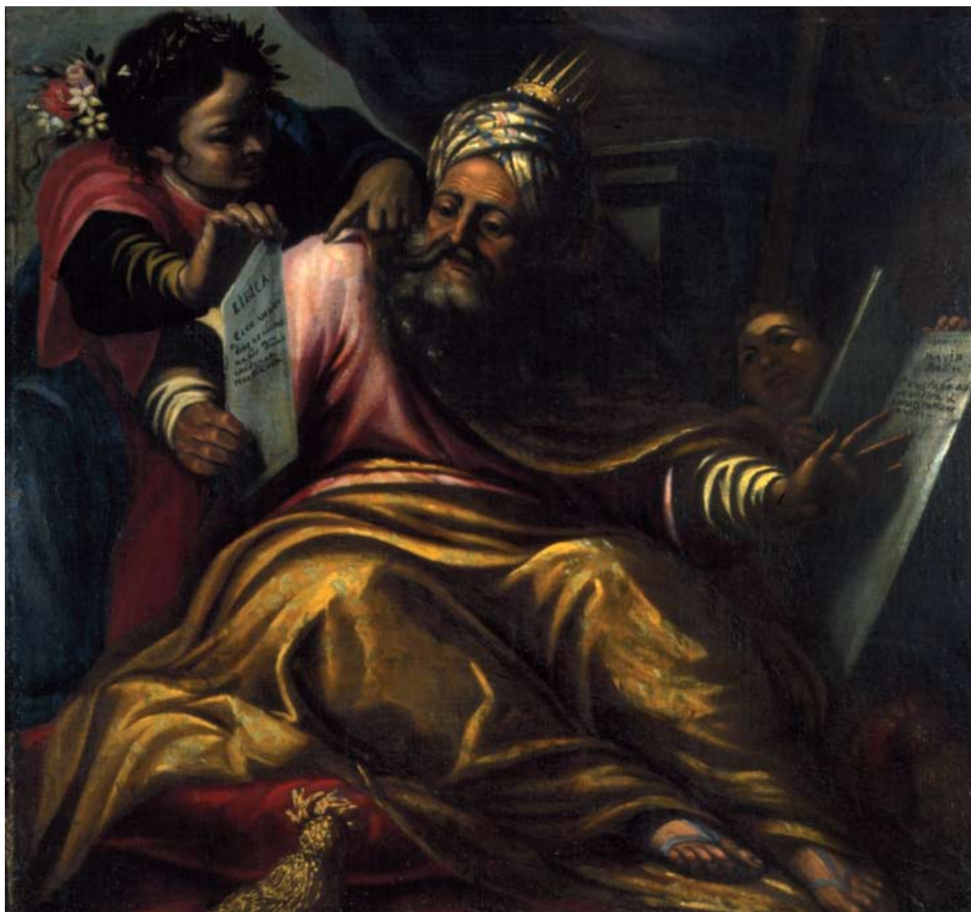
King David and the Libyan Sibyl, Our Lady of the Rocks, Perast