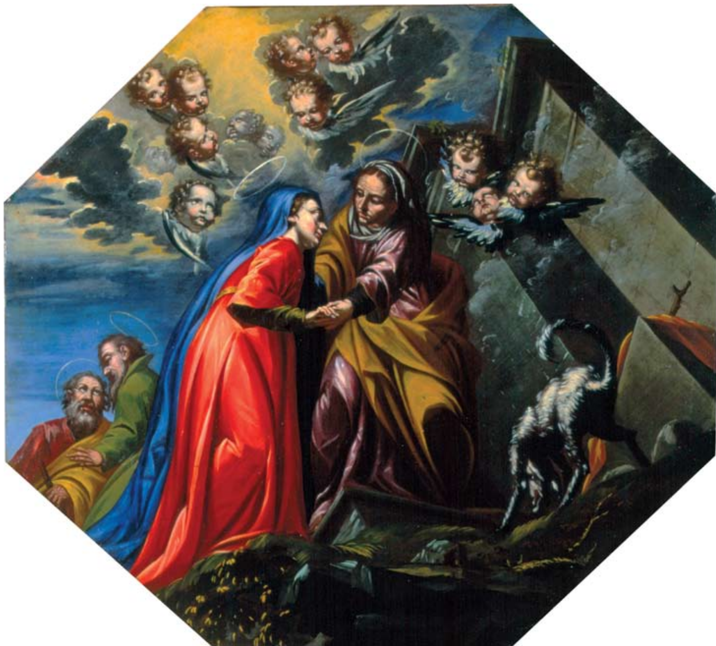
The Visitation, Our Lady of the Rocks, Perast