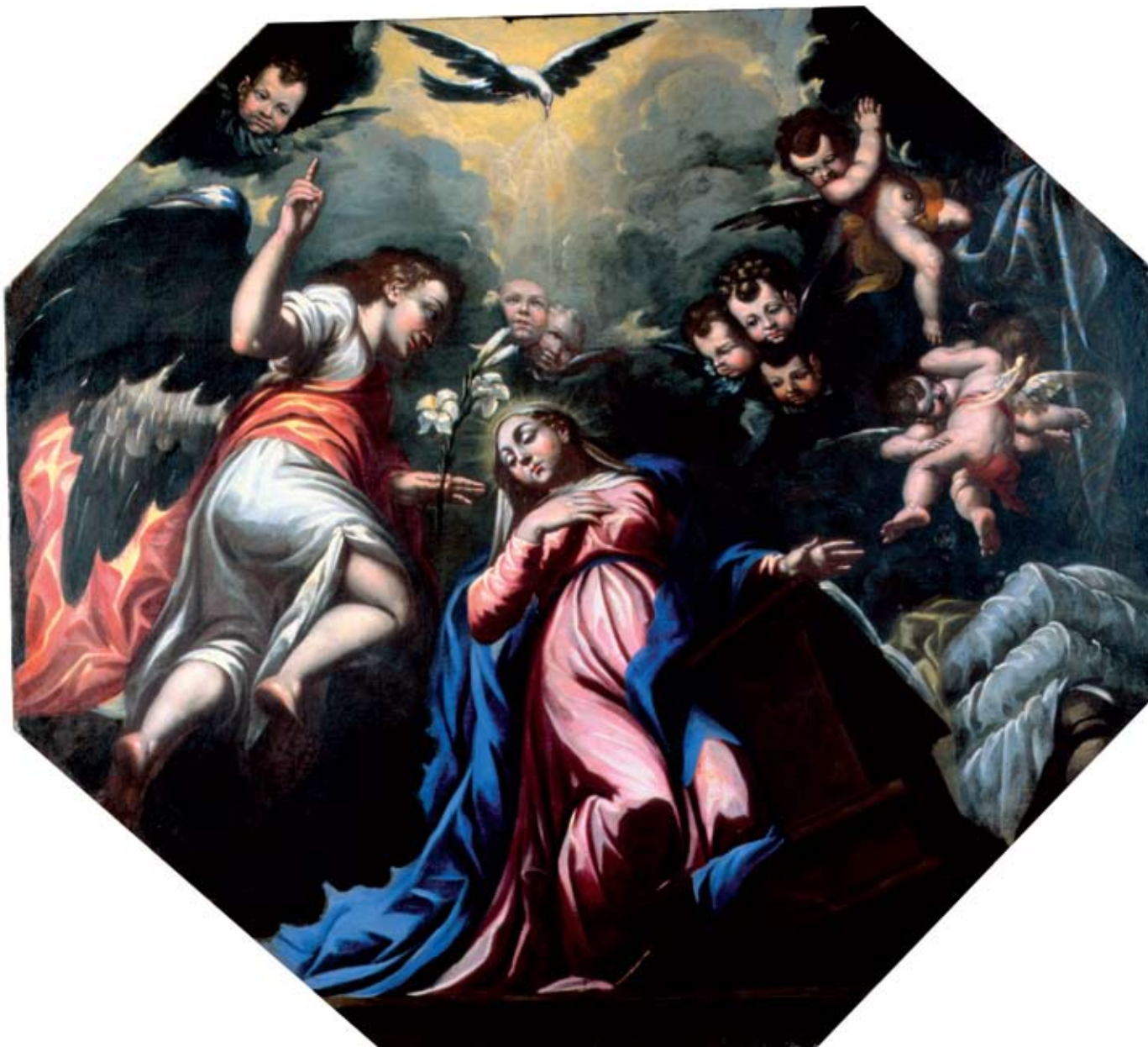
The Annunciation, Our Lady of the Rocks, Perast