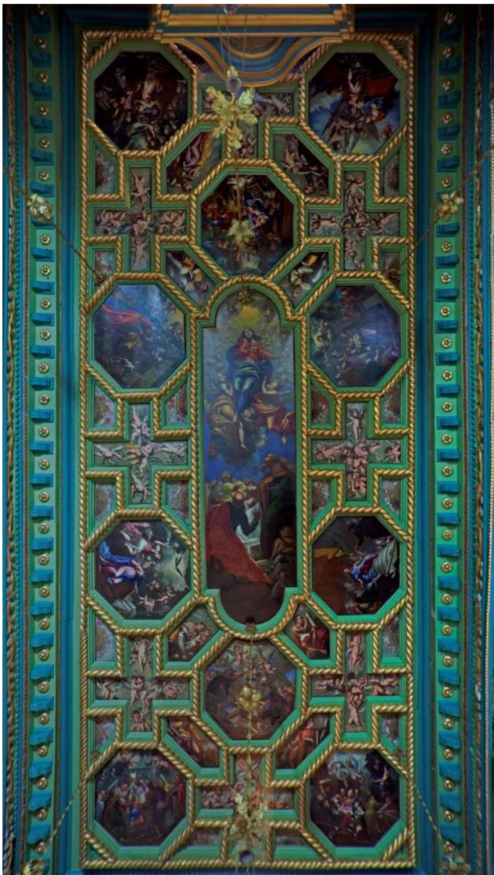
Strop, Gospa od Škrpjela, Perast Ceiling, Our Lady of the Rocks, Perast