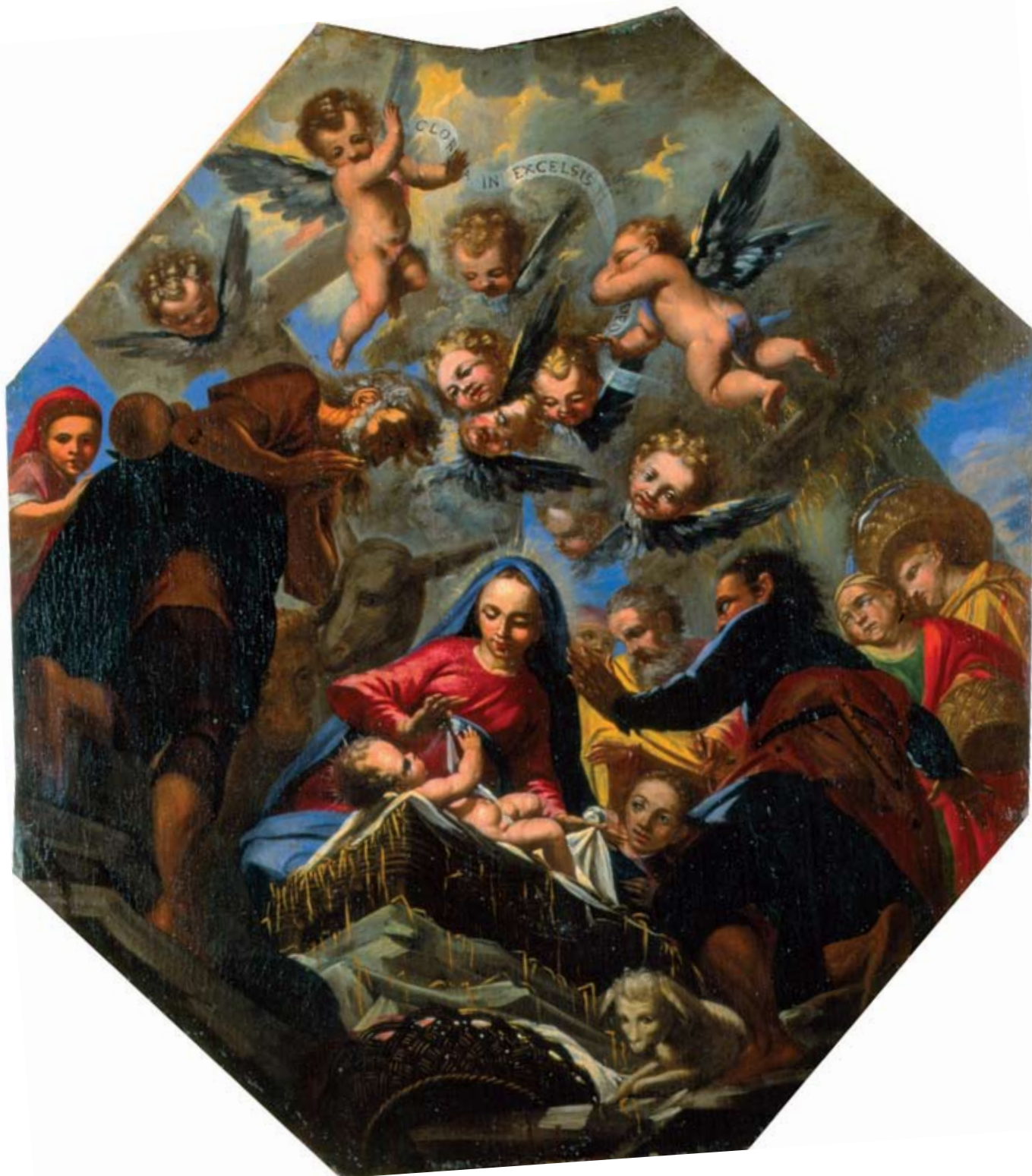
Adoration of the Shepherds, Our Lady of the Rocks, Perast