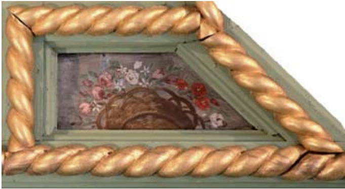
Košara s cvijećem, Gospa od Škrpjela, Perast Basket with flowers, Our Lady of the Rocks, Perast

li se u svom radu koristio grafičkim predlošcima uz pomoć kojih je oblikovao složene kompozicije i raspored likova na širokim pozornicama. Nije poznato je li radio pripremne crteže i skice, kartone i studije ili je izravno slikao na platnu. Nijedan njegov crtež nije sačuvan, ali nisu sačuvani ni mogući crteži Petra Matteija ili Mateja Ponzonija dok je boravio i slikao u Splitu. Je li posjedovao bilježnicu s crtežima slavni djela što ih je vidio u Veneciji? Je li slikao prema živim modelima? Postoji predaja da je u liku svećenika na slici Odbijanje darova Zaharija i sv. Ane prikazao nadbiskupa i mecenu Andriju Zmajevića, ali ostaje nepoznato je li i na drugim likovima možda skicirao svoje suvremnike, prijatelje i znance ili je ponavljao ustaljene tipove ljudskih lica što ih je naučio slikati gledajući tuđa rješenja. Ne smije se zaboraviti da je u Perastu sačuvan njegov Autoportret te portreti Vicka Bujovića i Frane Viskovića koji mu se opravdano pripisuju.