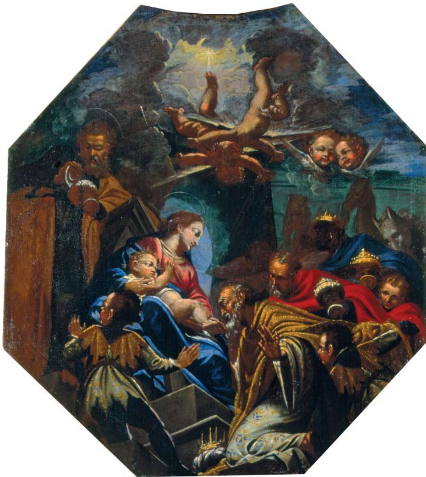
Adoration of the Magi, Our Lady of the Rocks, Perast