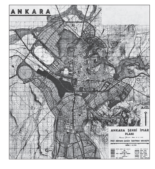
Fig. 11. Jansen Plan, 1927 St. 11. Jansenov Plan, 1927.

St. 10. Razdoblie Iansenovoga plana – Park mladosti (GENÇLIK PARKI), ANKARA, 1936.