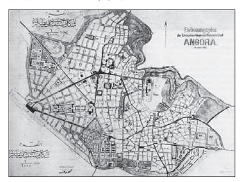
Fig. 4. The Lörcher Plan. 1924 SL. 4. LÖRCHEROV PLAN, 1924.

Sl. 3. Ankara početkom 19. stoljeća (period Turskog CARSTVA)