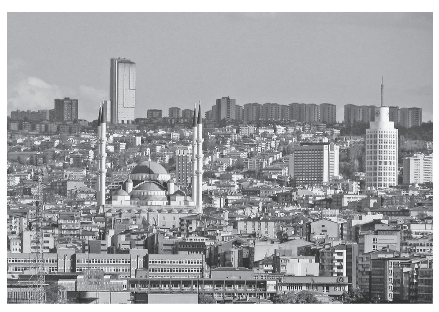
SL. 1. ANKARA FIG. 1. ANKARA