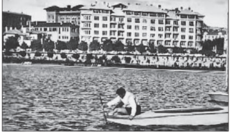
Fig. 9. Jansen Period - Streets of the Banks (BANKALAR CADDESI), ANKARA, 1934

Sl. 9. Razdoblje Jansenovoga plana – Ulice banaka (BANKALAR CADDESI), ANKARA, 1934.