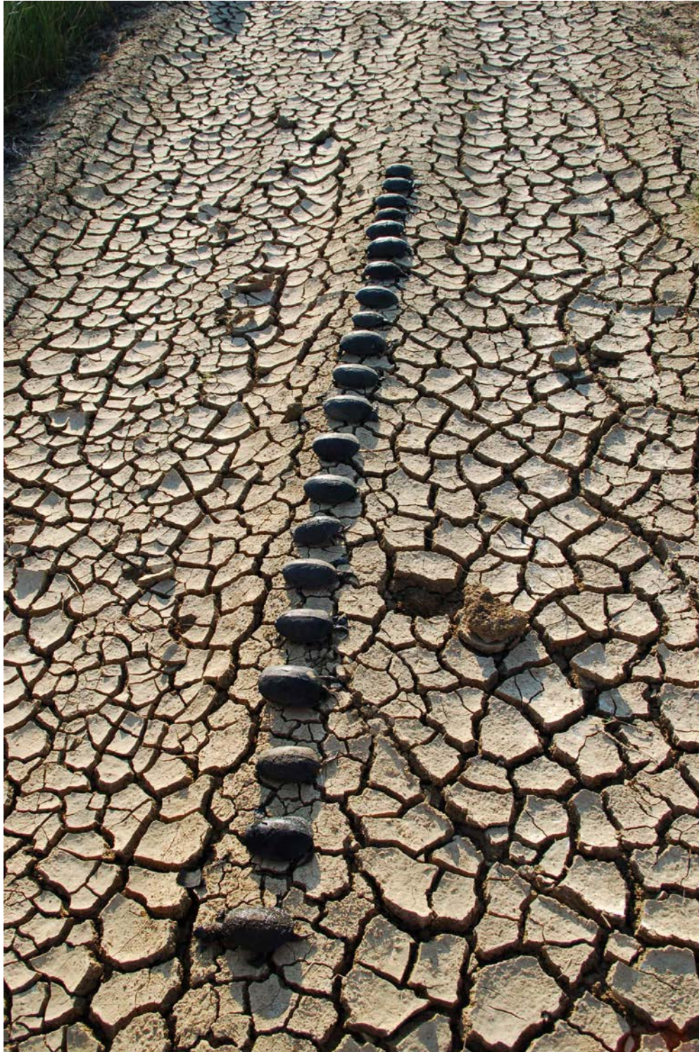
Figure 2. At Kolansko blato on the island Pag (Croatia) we found a fish trap with 21 dead Emys orbicularis inside.

Slika 2. Na lokalitetu Kolanjsko blato na otoku Pagu (Hrvatska) pronašli smo vršu sa 21 mrtvih jedinki vrste Emys orbicularis .