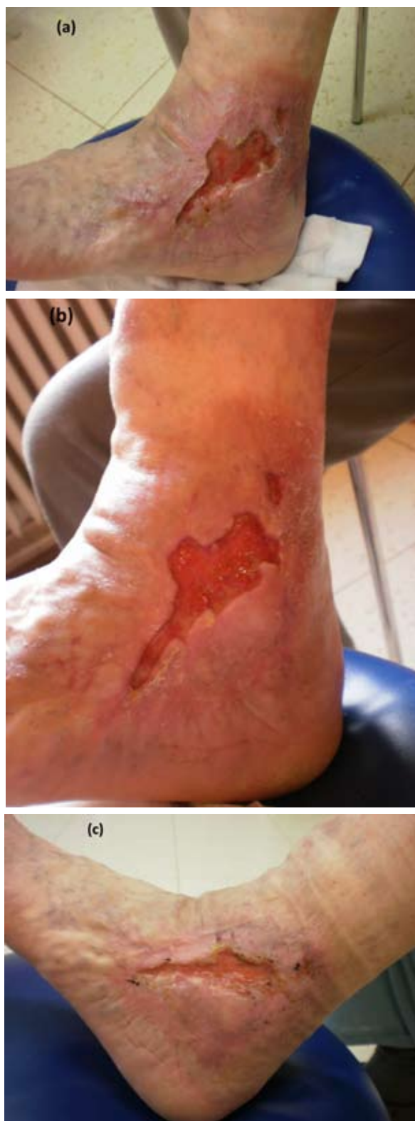
Figure 1. A 53-year-old man had a painful ulcer of venous etiology on the outer ankle of the left lower extremity for 7 months. The ulcer was photographed before treatment (a); 14 days after treatment initiation (b); and 6 weeks after treatment (c).