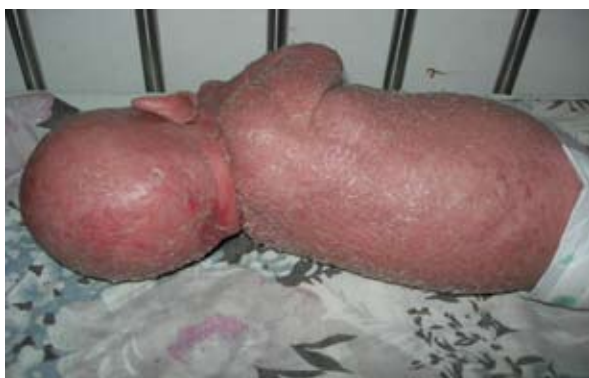
Figure 2. Alopecia associated with generalized exfoliative dermatitis.

mitogen stimulation. This can be seen in combined immunodeficiency patients as well as in other syndromes such as ataxia-telangiectasia and DiGeorge syndrome (7). OS is differentiated from severe combined immunodeficiency by additional autoimmunity and atopy (erythroderma, eosinophilia and high IgE level), which signify substantial immune dysregulation (8). OS is associated with a severe disturbance in both T- and B-cell development.