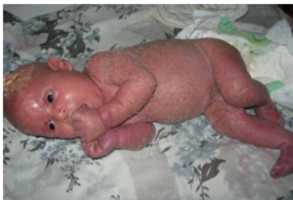
Figure 1. Generalized exfoliative dermatitis and absent eyebrows.

The study of cell mediated immunity revealed complete absence of B lymphocytes with normal number of T lymphocytes. The latter showed normal