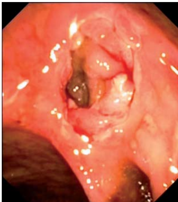
Fig. 2. Result of endoscopic balloon dilatation of the anastomotic opening.

performed with a TTS balloon of 18 mm in diameter. The procedure and post-procedural course passed without complications (Fig. 2). Additionally, a small bowel follow-through (SBFT) was performed, which showed an isolated loop of the small intestine (which corresponded to jejunoileal transition), with markedly irregular mucosal surface in the length of 11 cm; in some places shallow pseudo-ulcerations; spindle-shaped outgrowths of the contrast medium on one of the projections, which corresponded to a 10 mm-length of pseudo-diverticulum. The SBFT through the anastomosis was undisturbed. In therapy, methotrexate was replaced with azathioprine and budesonide. Considering the course of the disease, the patient was scheduled for biological therapies.