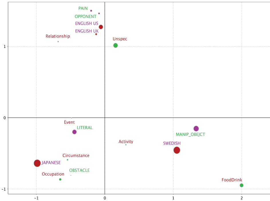
Figure 2. Metaphor for and Cause of ANXIETY in American English, British English, Japanese and Swedish (multiple correspondence analysis).

The cluster of features at the top encircles both the British and American data points, confirming their similarity relative to the usage-features in question. Two metaphors are found to be associated with the British and American English usage. Although we know that these metaphors do also occur with Swedish, in combination with the Causes that also cluster around the British and American data points, these metaphors are distinctly associated with the English language. The Causes in question are equally distinctly associated with the English usage patterns. From this, we have a clear profile of English - ANXIETY as a result of 'undetermined' abstract malaise or 'emotion' stress resulting from personal 'relationships'. This type of stress is conceptualised as an OPPONENT or as PAIN. Although there is always the risk of post hoc interpretation, this profile of ANXIETY does match intuitive expectations of the concept in these cultures. It also partially fits the technical use of the term, which underlines the idea of uneasiness resulting from non-specific causes or fears of future uncertainties.