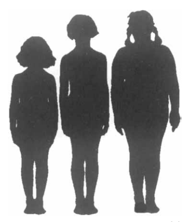
Fig. 1. Three eight years old girls<sup>3,6</sup>.

The above measurements, according to the type of clothing and importance, are divided into primary and secondary in order to better define the shape of the body<sup>6,8,9</sup>. In the Croatian clothing industry, until recently, the former system (JUS) still applied as Croatian standards (HRN) were used. This particular standards dating back to the 70-ties of the last century, in the meantime, are supplemented and modified so that there is doubt to their validity. In February 2012 the Croatian Technical Report (HRI 1148:2012) entitled »Anthropometric System – Measuring and Size Designation of Clothes and Footwear« was published. The report includes specifics