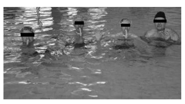
Fig. 1. Members of the Laryngectomy Swimming Club in a pool.

At the end of three months, the patients were divided into two groups: the swimmers (n = 17) and the nonswimmers (n = 83). The swimmers were members of the Laryngectomy Swimming Club and in average swam 3 hours a week. Normal swimming is possible after total laryngectomy in a well-motivated and previously experienced swimmer with simple equipment. These swimming aids consist essentially of an extension tube plugged firmly and securely into the tracheal stoma, forming a water-tight seal while the other end of the tube is flattened and put between the lips (Figures 1 and 2). During inspiration, the airflow goes through the nose, into the mouth, and through the tube in the trachea and the lungs. The laryngectomee should never swim alone, and it is strongly advised that attending swimmers or family should be trained in the rescue and resuscitation of a laryngectomee<sup>1,9</sup>