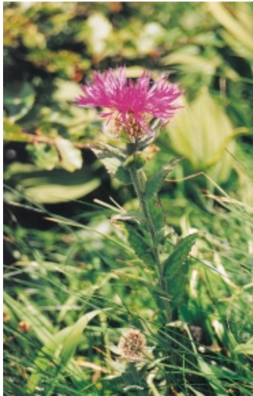
Fig. 1. Centaurea uniflora subsp. nervosa

In July 2001, during research into endangered and protected flora of the north west, extended part of the »Risnjak« National Park, we found the taxon C. uniflora subsp. nervosa in the region of Guslica (Fig. 1). Two specimens were deposited in