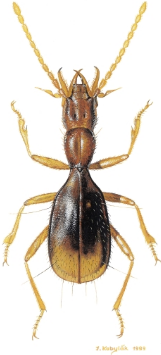
Fig. 1. Lovricia aenigmatica n. sp. holotype female, habitus – J. Kobylák del. 1999