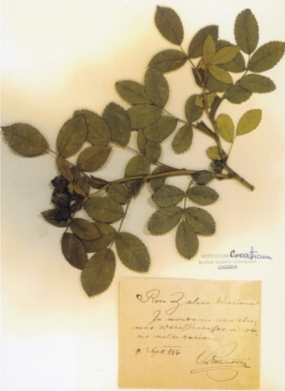
Fig. 1. Vukotinović's specimen of Rosa zalana Wiesb. in Hb ZA.