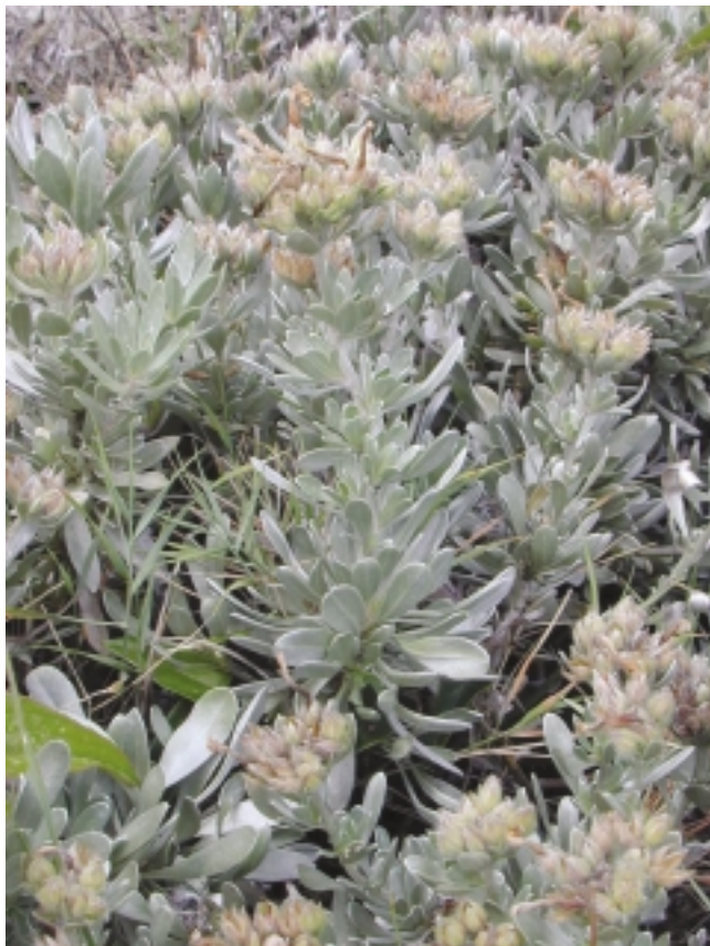
Fig. 1. Convolvulus cneorum L.

At present, Volujac on the Dugi otok island is its farthest habitat to the north while the small islands of Mrkan and Bobara near Cavtat are its most southern habitats on the eastern Adriatic coast. The new habitats (Tab. 1) on the Šibenik archipelago islands and small islands fill in the gap in the distribution of this endemic species on the eastern Adriatic coast.