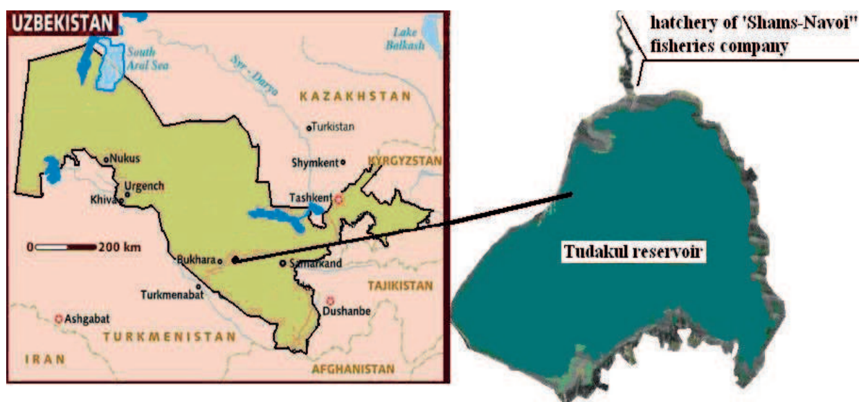
Fig 1. Tudakul reservoir

Many aspects of silver carp biology were studied in conditions of pond fish culture in the region, including fish growth (Kamilov, 1985; Aliev et al., 1994). However, the growth of silver carp in wild environments was studied poorly. The study of age and growth is essential for fisheries and management. Age and growth determination of silver carp encountered some difficulties (Kolar et al., 2005). The goal of this research is to study the age and growth of silver carp in Tudakul reservoir.