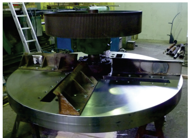
Figure 2 The assembled wheel of the disc chipper

The multi-blade disc chipper (Fig. 2) has mass about 3600 kg and an improper use of the disc may result in a dismantling of the disc from the machine, especially at the maximum speed. The frequency of vibration of the shaft chipper depends on the size and distribution of its mass (such as the knives or bed knives), the type of support of the shaft chipper, and its elastic properties. Periodically changing the lateral forces that occur, for example, an unbalanced rotating mass induces flexural vibrations. This type of vibration will increase the risk of the resonance amplitude. This is due to a reduction of the dimensions of the machine as well as an increase in the speed of the chippers. Vibrations in the chipper can be the result of external cyclic forces causing vibrations or other factors, such as the result of an improper seating wheel, where the centre of gravity does not coincide with the axis of the shaft. In order to prevent damage, high-speed shafts and the parts which are embedded on them, such as the chipper disc, must be statically and dynamically balanced;