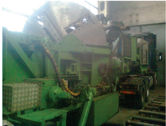
Figure 1 Mobile disc chipper ready to be balanced

The selection of the constructional features of the shaft, which is based only on strength, does not always work reliably. In many cases the proper functioning of the shaft is decided by the mechanical vibrations. Vibrations of the shaft may cause disturbances in the disc chipper, and is caused by vibrations in the whole machine along with the car. The phenomenon of resonant amplitude strengthening may cause the destruction of the entire machine.