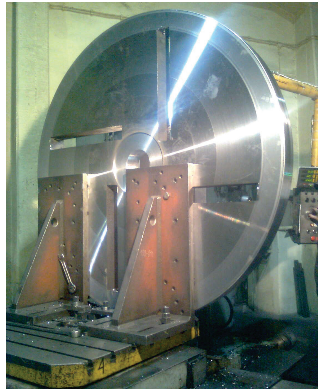
Figure 4 Boring holes in the disc chipper

conditions for the formation of a build-up edge, an increased appreciation of material deformation on the surface layer, and accelerated blade wear [16 ÷ 19]. An additional problem was the measurement of the disc because the disc in the turning process reached a temperature preventing a meaningful reading. In relation to problems in turning, boring holes and pockets for knives and bed knives caused problems only because of the large size (Fig. 4).