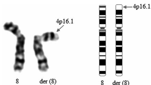
Fig. 1. Partial karyotypes of the GTG banded chromosomes and ideograms of a proband showing de novo derived chromosome 8.

Cytogenetic examination of GTG banded metaphases (at resolution of 550 bands) obtained by standard methods 6 , showed an unbalanced proband's karyotype with extra chromosome material at the short arm of the chromosome 8 (Figure 1) using Olympus BX61 microscope and Cytovision 3.93 software (Applied Imaging, England). FISH (fluorescence in situ hybridization) with spe-