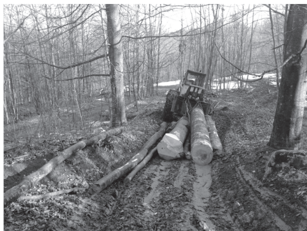
Fig. 1 Skidding with LKT 81T skidder