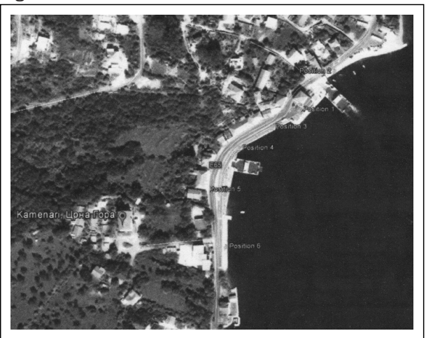
Figure 1 - Satellite imagery of the Village Kamenari with measurement sites