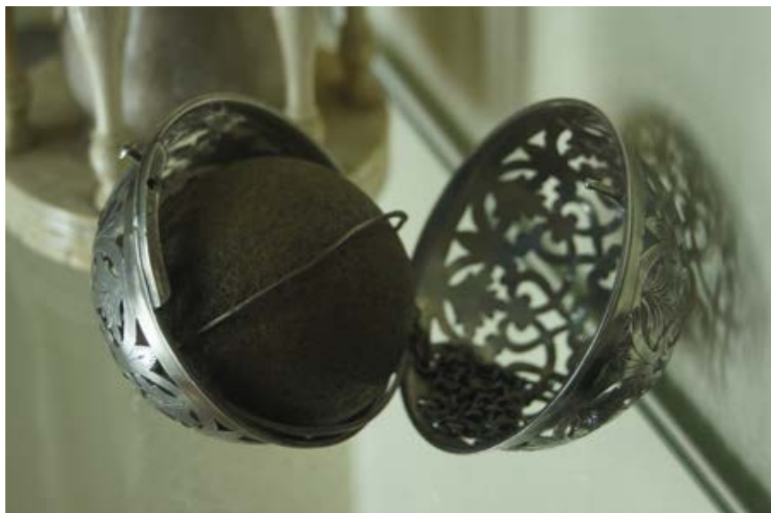
Fig. 9 – Spherical oriental bezoar within a silver Indo-Portuguese filigree container. 17th century. Size: diameter of bezoar 6,5 cm; diameter of the container 9 cm. Távora Sequeira Pinto Collection (Oporto).

Slika 9 – Okrugli istočnjački bezoar u indo-portugalskoj srebrnoj filigranskoj kutijici iz 17. stoljeća. Dimenzije: promjer bezoara 6,5 cm, promjer kutijice 9 cm. Kolekcija Távora Sequeira Pinto (Oporto).