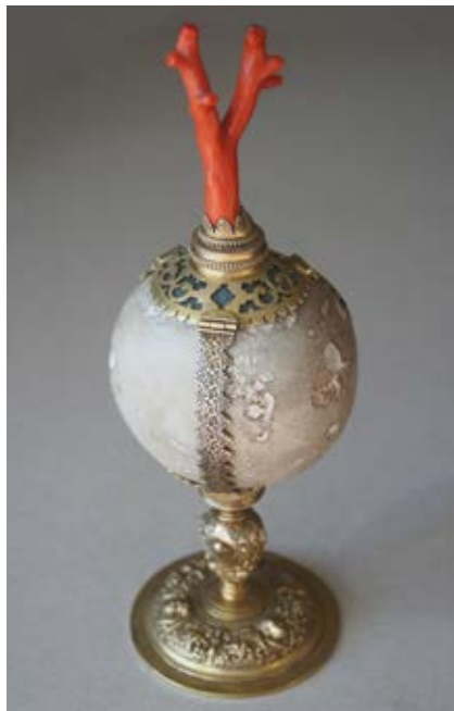
Fig. 8 – Oriental bezoar stone mounted on a golden filigree stand, decorated with a coral branch on the top. 18 th century. Size: height 25.6 cm, diameter 9 cm. Távora Sequeira Pinto Collection (Oporto)

Slika 7 – Privjesak s istočnjačkim bezoarom na zlatnom lancu. 17. stoljeće. Dimenzije: visina 6,4 cm, promjer 3,8 cm. Kolekcija Távora Sequeira Pinto (Oporto)