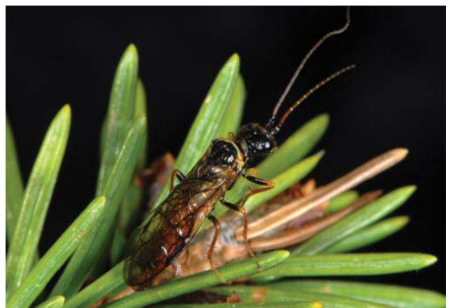
Figure 1, 2, 3: Cephalcia arvensis (Panzer, 1805): larvae, a head of young prepupa and adult specimen Slika 1, 2, 3: Cephalcia arvensis (Panzer, 1805), larva, glava mlade pretkukuljice i imago

the base of sequences (GenBank base), there is no reference sequence down to the species level.