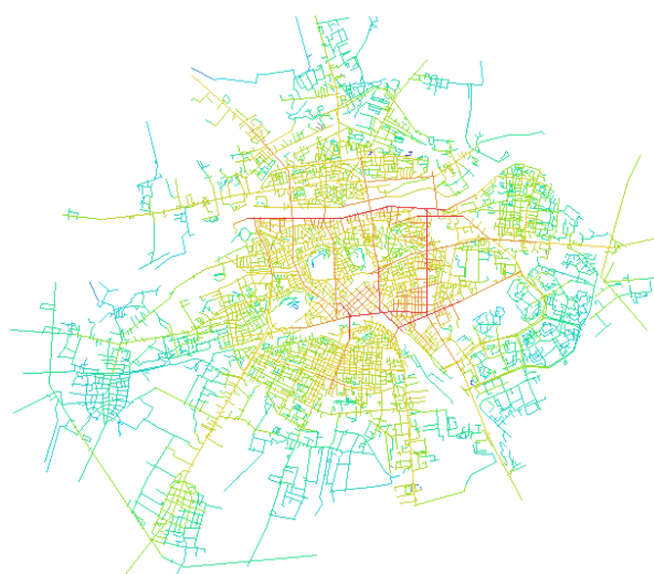
Figure 2* Axial total integration map of the city of Plovdiv. Red colour indicates higher while blue indicates lower integration

Field noise measurements had been carried out by municipality experts following the ISO 1996-1/2005 (27) and ISO 1996-2/1987 procedures (28). Sound levels were measured in the field using "Brüel & Kjær Type 2240" sound meter and "Brüel & Kjær Type