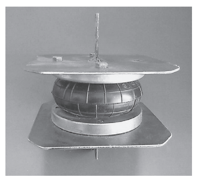
Figure 2 Pneumatic-flexible element with preparation