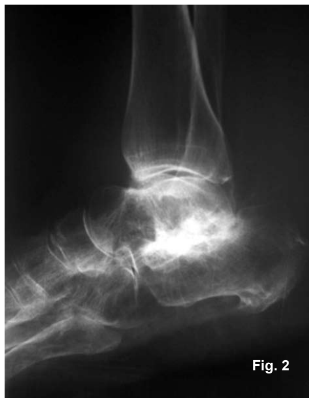
Figs. 1 and 2. Conventional x-rays of both right talocrural and left talocalcaneal joints: diffuse demineralization, narrowed joint space of the right talocrural joint, severe deformities and calcifications in the left talocalcaneal joint.