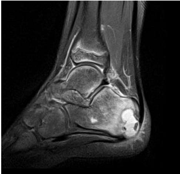
Fig. 1. Sagittal fat-suppressed proton density weighted image of the left heel shows osteolytic lesion in the posterior part of the calcaneus and fragmented apophysis, with surrounding bone marrow and subcutaneous edema.