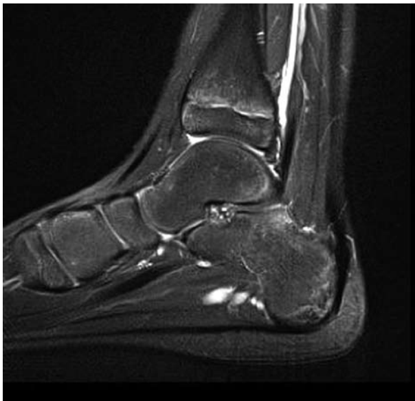
Fig. 3. Sagittal fat-suppressed proton density weighted image of the right heel shows mild edema of calcaneal apophysis with sclerosis and fragmentation of ossification center.

lift, a monitored stretching program, icing, and anti-inflammatory agents normally reduce the symptoms 4 . To prevent recurrence, a good pre-exercise stretching program is obligatory.