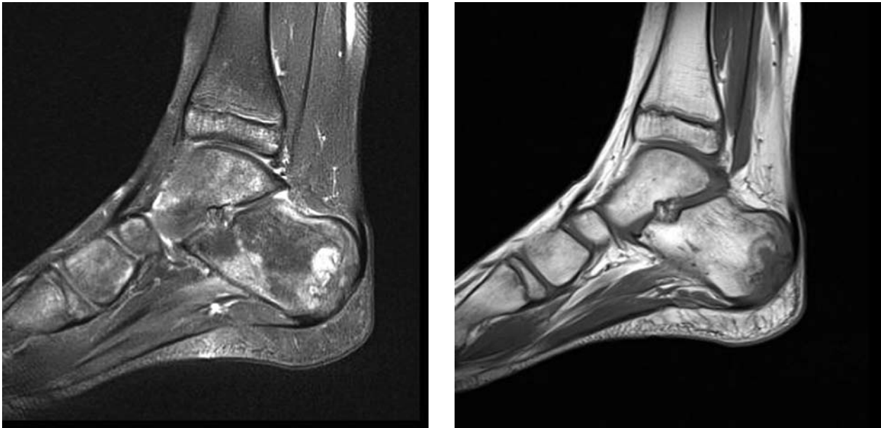
Figs. 4 and 5. Sagittal fat-suppressed proton density weighted image and sagittal T1 weighted image of the left heel show significant regression of osteolytic lesion in the calcaneus, replacement with granulation tissue surrounded with new bone formation and minimal bone edema.

neus with peripheral enhancement after contrast administration and surrounding bone and subcutaneous edema, compatible with osteomyelitis (Figs. 1 and 2). Apophysis was fragmented and sclerotic. There were also signs of calcaneal apophysitis of the right heel (Fig. 3). After six weeks of parenteral treatment (with clindamycin), the patient's condition significantly improved. Follow up MRI performed 3 months later showed significant regression of the osteolytic lesion and replacement with granulation tissue surrounded with new bone formation (Figs. 4 and 5). Minimal bone edema was present.