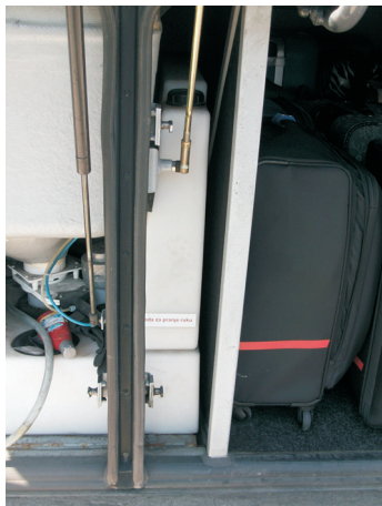
Fig. 1. Long, narrow, plastic bus water storage tank.