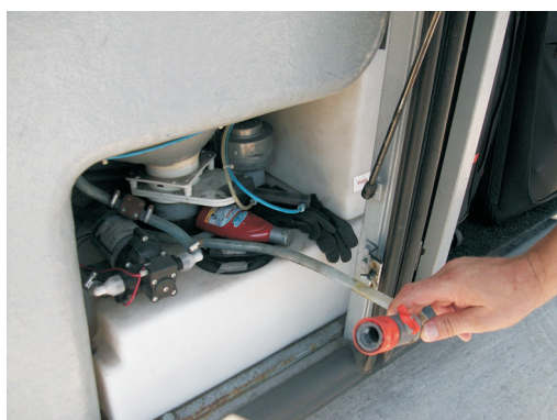
Fig. 2. Rubber house of bus water storage tank with regulator jet.