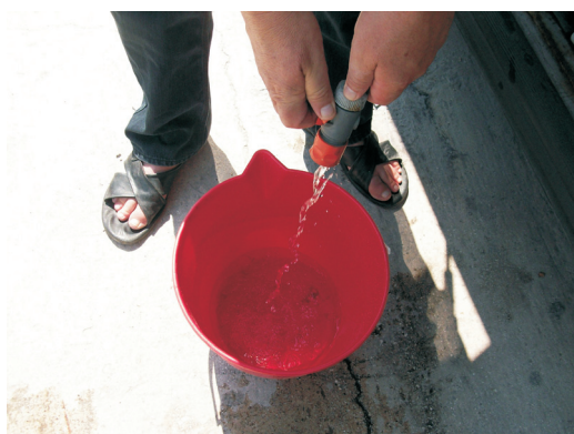
Fig. 3. Regulator jet and dirty water from bus water storage tank.

Five samples of water were collected in 1 litre sterile plastic containers with biocide added.