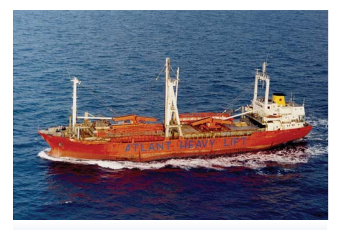
Figure 7. 'Ston'.