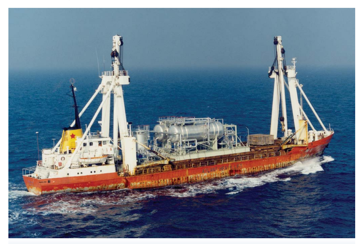
Figure 4. 'Jahorina'.

Renamed the 'Lapad', she remained the most advanced heavy lift vessel in the fleet of Atlantska Plovidba for a long time. She served for 22 years and was finally broken up at Turkish Aliaga scrapyard in 2006.