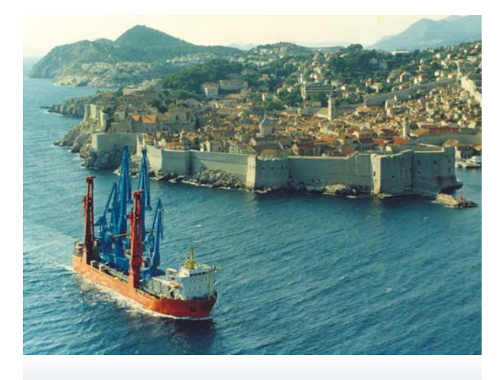
Figure 1. 'Gruž' sailing by the ancient walls of Dubrovnik.

So a chapter on Adriatic's strong ships was closed after 35 years. A period long enough to be remembered. In all these