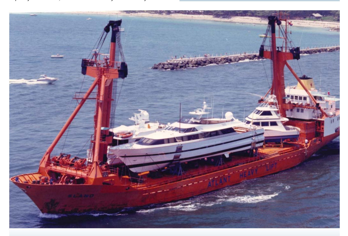
Figure 8. 'Slano'.