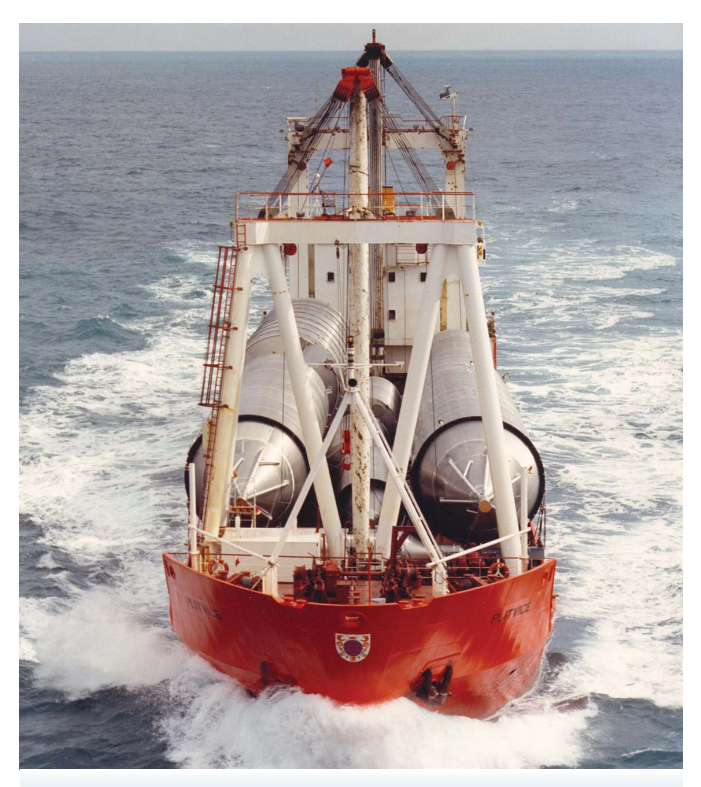
Figure 9. 'Plitvice'.