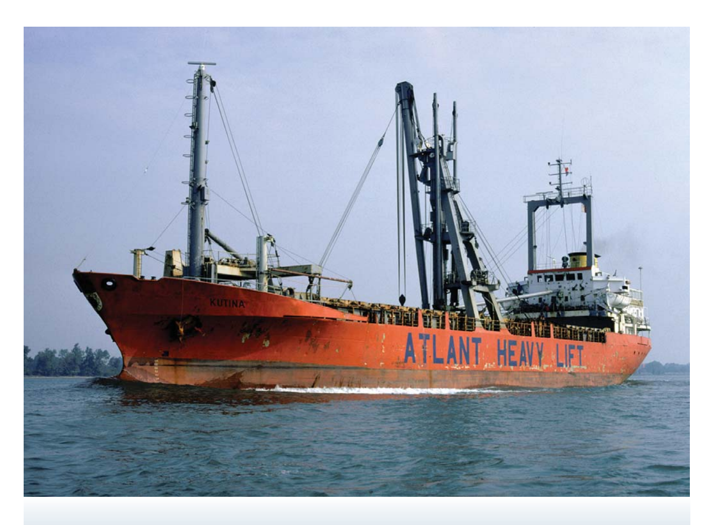
Figure 3. 'Kutina'.

to a lesser extent, Dutch companies, had to be transported by ships to the port of Rijeka. Being a heavy oversized load, these cargoes required heavy lifters. So Atlantska Plovidba purchased the 'Super Scan', a six-year old ship.