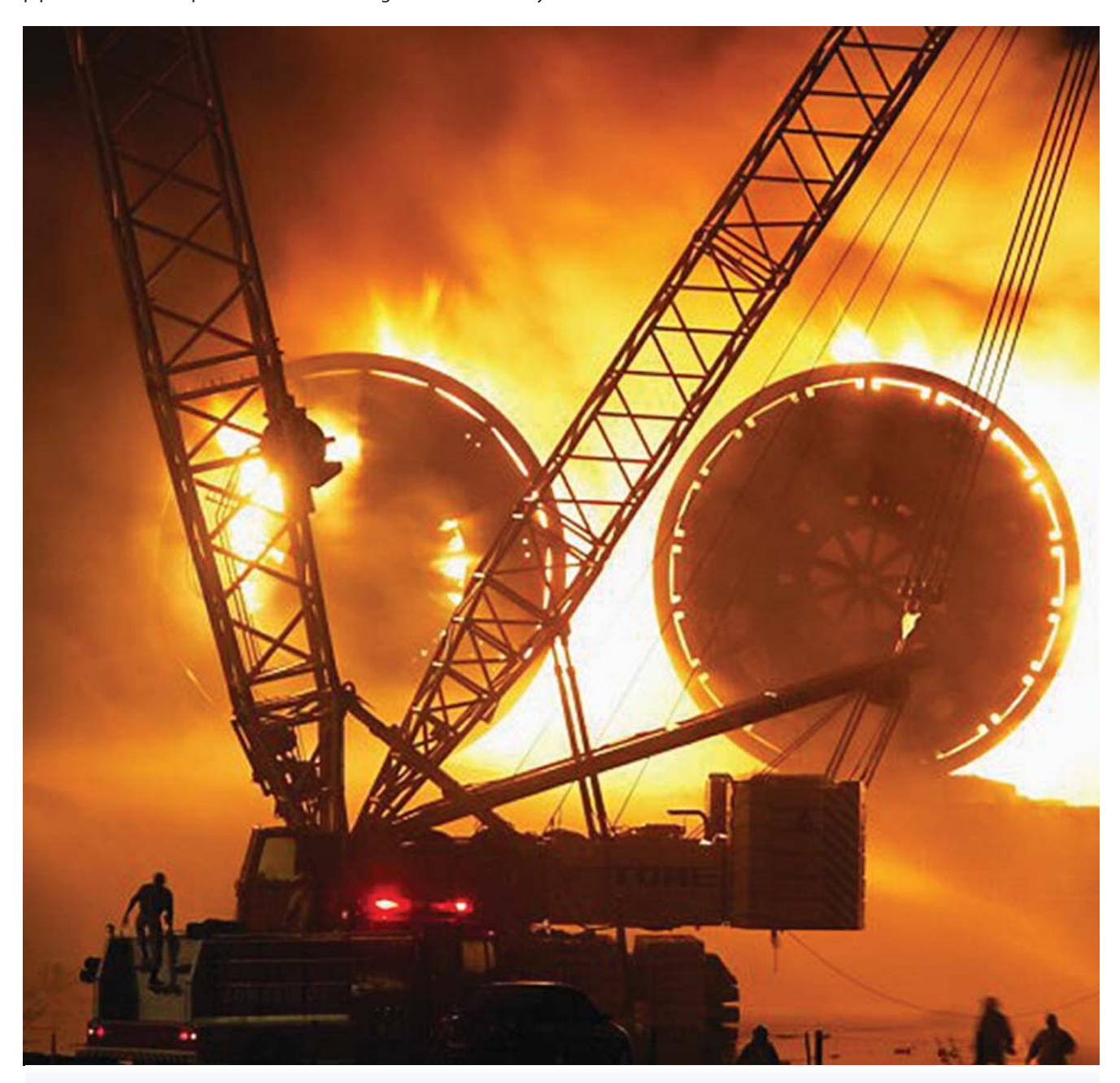
Figure 13. 'Atlant Trina' in flames.