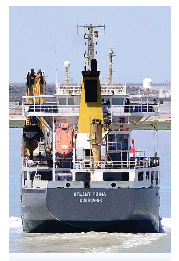
Figure 12. 'Atlant Trina' – the last of ships.

After 15 long years, two ships finally joined the fleet of the Atlant Heavy Lift in 2002. These were second-hand sister ships with rather unusual names – the 'Love Letter' and the 'Love Song'. They marked the beginning of the German phase in the chronicles of Adriatic's strong ships.