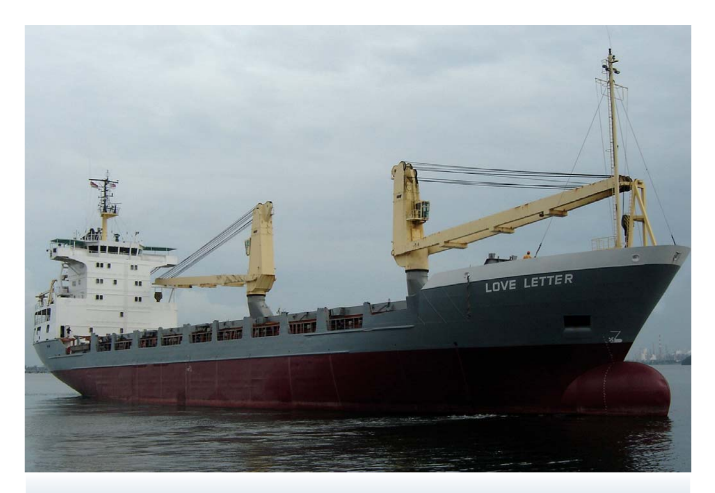
Figure 10. 'Love Letter'.

Shipping to carry heavy equipment from Houston, Texas to the oil terminal on Arzanah Island in the Persian Gulf. In November 1987 the 'Valkenier' became the 'Slano' and continued world-wide trading until 2001.