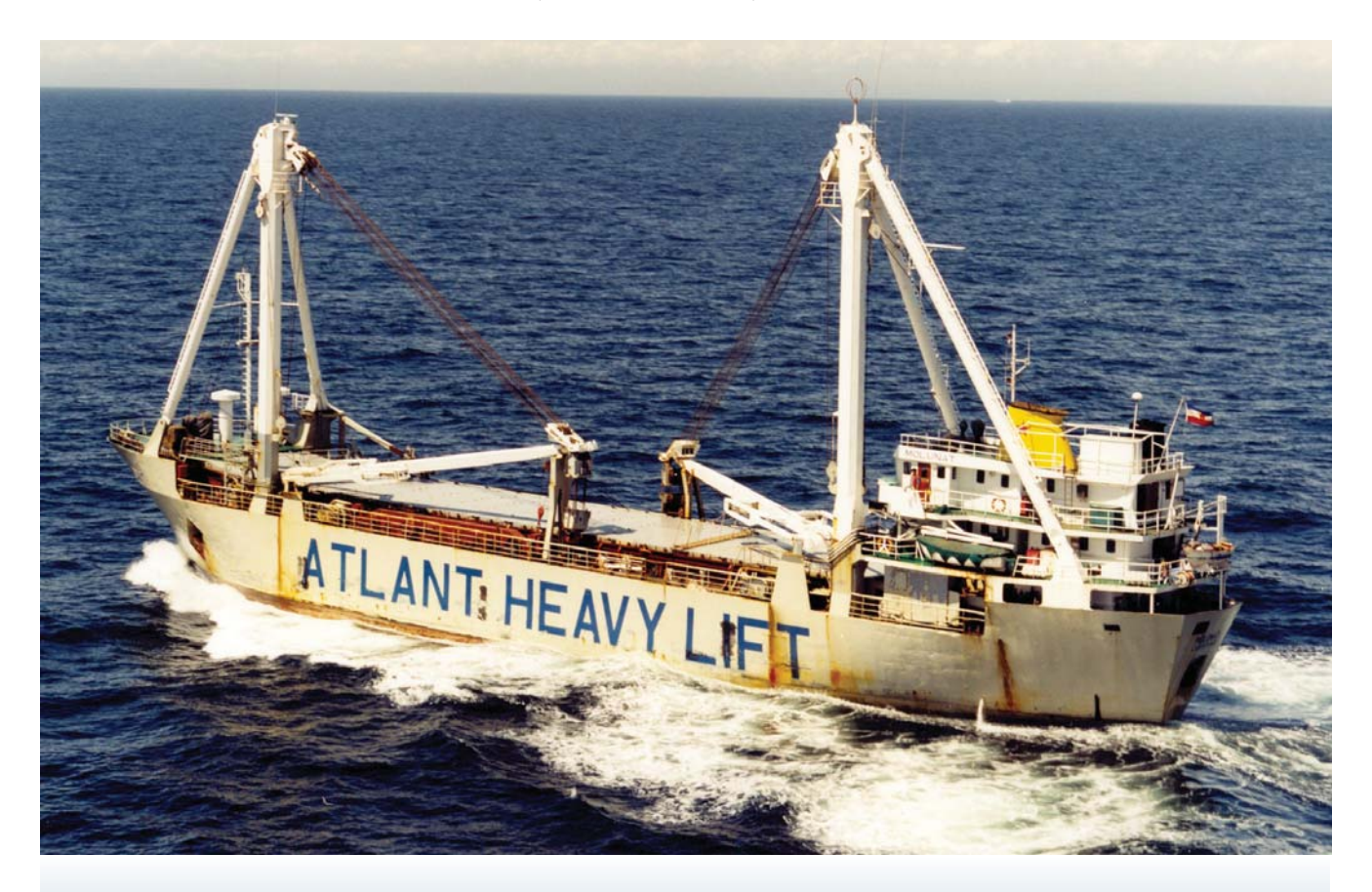
Figure 5. 'Molunat'.

The story of the 'Gruž' begins in the late spring of 1985 when Atlantska Plovidba ordered her at Dutch shipyard Scheepwerf en Machinefabriek Ijsselwerf B.V. situated at Kapelle, a small town on the bank of the Ijssel River. The ship greatly differed from the heavy lifters of the time. Her dimensions were not so impressive: