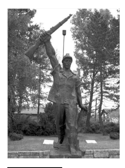
Figure 4: Ivan Sabolić, The Monument to the Husino Miner, Husino, 1953.

The construction of this monument was so significant to the local community that they organized a public forum in Tuzla, in order to discuss the final version of the monument. The participants in the discussion included "public and cultural workers, as well as many citizens and representatives of workers' collectives. They decided that the monument to Husino miners symbolizes a miner who abandons the pickaxe, the drill, and the lamp, and takes a rifle to join the Partisans" (A. H. 1952: 4).