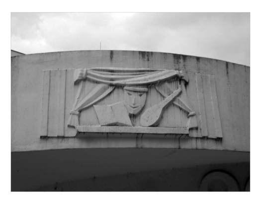
Figure 13: Ivan Sabolić and Jasna Bogdanović, The Memorial Fountain "Six Factories", detail (relief depicting symbols of the cultural superstructure of the worker collective), Belišće, 1976.