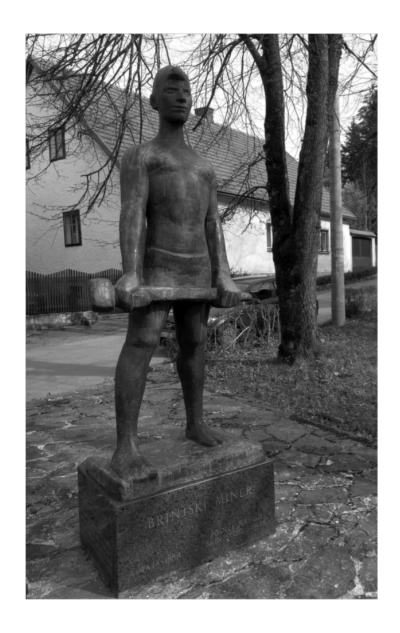
Figure 7: Kosta Angeli Radovani, The Monument to the Brinje Miner, Brinje, 1984.