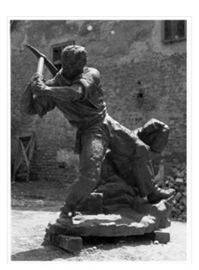
Figure 3: Antun Augustinčić, The Monument to the Miner, 1936—1939.

Monuments Dedicated to Labor and the Politics of Memory in Socialist Yugoslavia