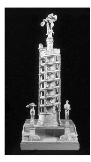
Figure 2: Auguste Rodin, the model for The Monument to Labor, 1898—1899. Musée Rodin, Paris (http://www.museerodin.fr/en/collections/sculptures/tower-labour)