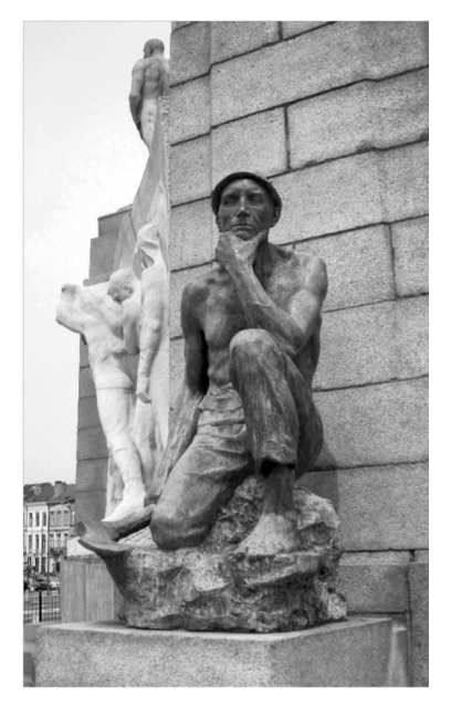
Figure 1: Constantin Meunier, The Miner (The Monument to Labor), Bruxelles, 1980—1893

most anticipates, with its allusion to 'endless progress' (Sanders 1978: 478), the basic form of Vladimir Tatlin's unrealized project for The Monument to the Third International from 1920. Although both Meunier's and Rodin's sculptural depiction of labor remain integrated in the elaborate symbolic sculptural composition, Rodin's project additionally creates a framework for a conscious affirmation of this new political subject through a realistic representation of the worker figure (Sanders 1978: 479). Due to the escalation of socialist demands in Europe at the beginning of the 20th century, Rodin's affirmation of labor was deemed ideologically inappropriate; consequently, it was never realized, despite the ten years of planning and the existence of an international petition in support of its construction<sup>2</sup> (Sanders 1987: 482). The persistent refusal by the French government and private investors to finance the construction of the Monument to Labor illustrates the critical role of the patron's ideological position and political opportunism. For this reason, during the 19th century the topic of labor was tied primarily to more accessible artistic media—especially drawing and graphic arts—that will remain recognizable carriers of social- and class-consciousness in the art practice of liberal and capitalist societies throughout the 20th century.