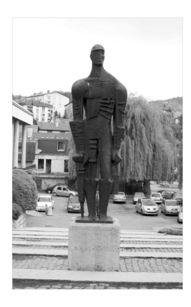
Figure 5: Stojan Batič, The Miner, Trbovlje, 1961.

the attack on the members of ORJUNA<sup>14</sup>—as well their placement at the base of a fresco depicting the development of the labor movement in Trbovlje from the first workers' strikes and the National Liberation War to socialist prosperity—it is clear that these sculptures have a monumental character and an unambiguous ideological background.