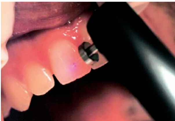
Slika 1. Individualna prilagodba DIAGNOdent uređaja. Figure 1 Individual adjustment of DIAGNOdent unit.

The purpose of this study was comparison of occlusal caries detection by conventional visual - tactile diagnostic method and DIAGNOdent (KaVo, Dental GmbH, Germany) device. The investigation comprised 30 patients, of age 5 to 50, who were informed of the study's purpose, and their written consent was obtained. A total of 960 teeth were included in the study. After the assessment of caries lesions by visual-tactile examination, the suspected teeth were also examined by DIAGNOdent device. Prior to laser measurement, the investigated teeth were professionally cleaned by PROPHYFlex 3 (KaVo Dental GmbH, Germany) device. DIAGNOdent was calibrated with a ceramic standard and then customised according to individual patient. The individual adjustment was made by measuring a baseline fluorescence value of a healthy tooth surface, in most cases labial surface of the central incisor. The value was then subtracted from the fluorescence of the suspected teeth. The measurement