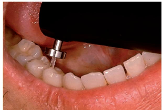
Slika 2. Detekcija karijesa DIAGNOdent uređajem. Figure 2 Caries detection by DIAGNOdent unit.