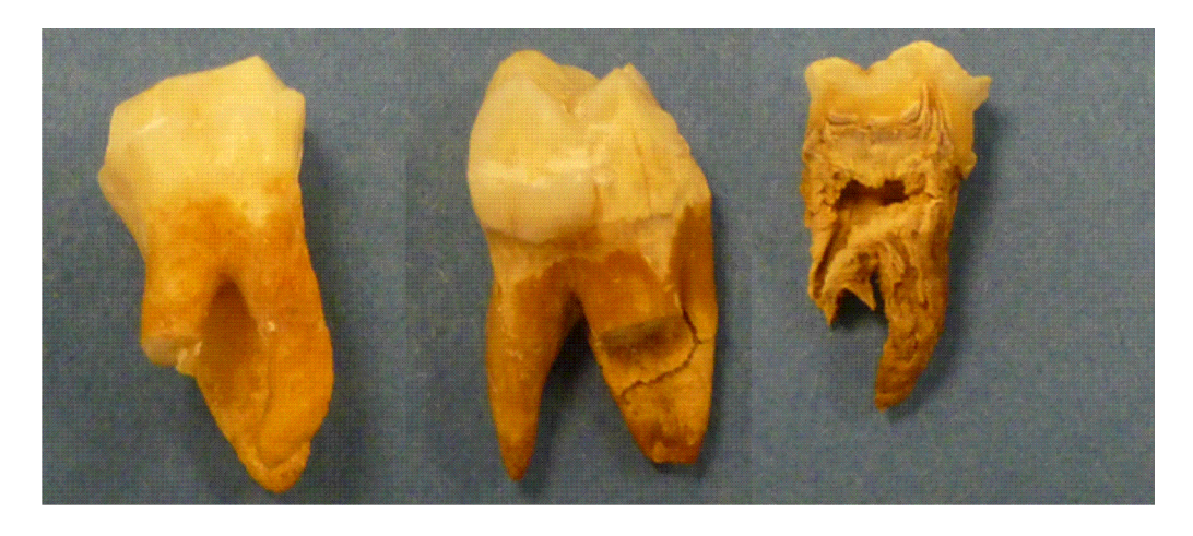
Figure 1. Molar teeth from West Heslerton, from the left HP2BA897 (M1), HP2BA503 (M2), HP2BA903 (M3) showing the range of macroscopic preservation of the dentine. See Table 1 for details.

23. Ambrose SH, and Norr L. 1993. Experimental evidence for the relationship of the carbon isotope ratios of whole diet and dietary protein to those of bone collagen and carbonate. In: Lambert JB, and G.Grupe, editors. Prehistoric human bone: archaeology at the molecular level. Berlin: Springer-Verlag. p 1-37.