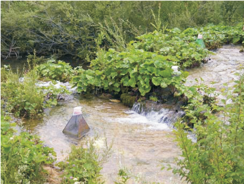
Fig. 3. Plitvica Stream (Plitvice Lakes NP).

Prošće and the lowest, Lake Kaluđerovac, in the range from 30% to 4.4% respectively. Our results confirm that the upper lake sustains a richer and more abundant population of Ephemeroptera.