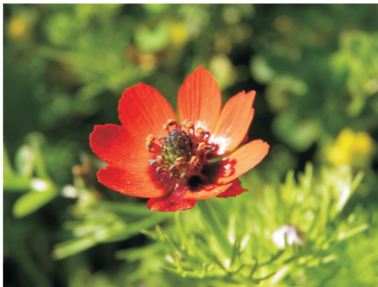
Fig. 2. Adonis aestivalis L. Specimen sampled at the karstic depression (' polje ') of Prapatna near the village of Smokvica, the island of Korčula (photo: M. Jeričević).

According to NIKOLIĆ (2014), among the newly reported taxa three can be considered as endemic: Consolida brevicornis (Vis.) Soo and Trifolium mutabile Port. were found on the island, and Stachys menthifolia Vis. was observed on the peninsula. Consolida brevicornis and Stachys menthifolia are Illyrian-Balkan endemics, while Trifolium mutabile has a wider occurrence in the Mediterranean (EURO+MED, 2006–2014). In fact, all of these taxa have very narrow distributions in the coastal and insular part of South Croatia. The island and peninsula now have 40 and 42 recognised endemic taxa, respectively.