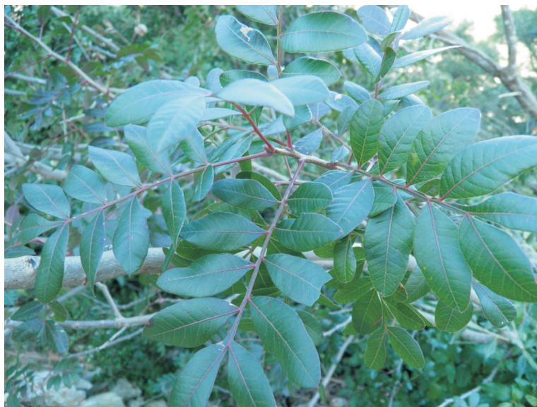
Fig. 3. Pistacia x saportae Burnat. Specimen sampled on the Smrč hill above the Pavja Luka Bay, the southern shore of the island of Korčula.

In total, 13 taxa were Strictly Protected (SP) by Croatian Law: Adonis aestivalis L., Arundo plinii Turra, Cephalanthera damasonium (Mill.) Druce, Consolida brevicornis (Vis.)