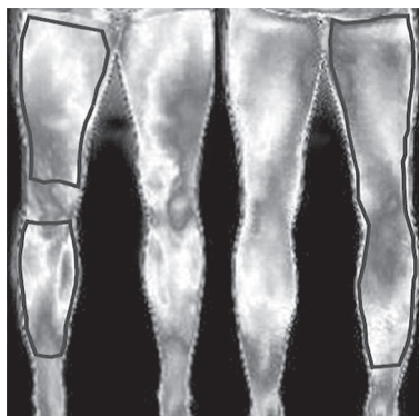
Figure 1. The front (a) and back (b) thermogram with marked zones for automatic analysis.

Before the exercise the subjects adapted to ambient conditions for 15 minutes, with the lower limbs unclothed, to achieve thermal equilibrium with environment conditions.