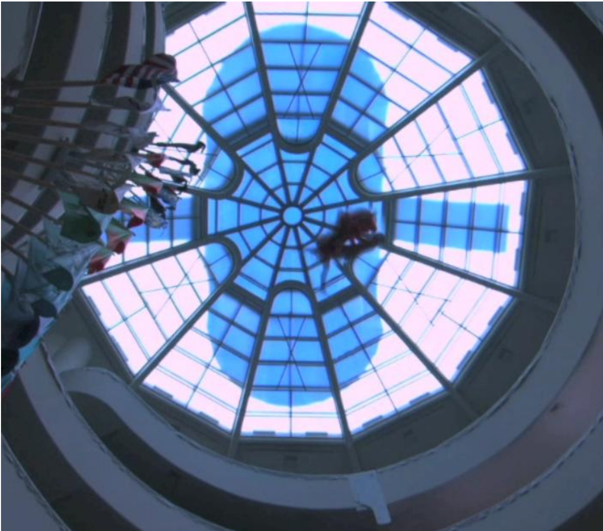
Illustration 2: The Apprentice and Aimee Mullins flying across the Guggenheim's ceiling. Screenshot from: Barney, Matthew. "The Order." Cremaster 3. © Matthew Barney

The laws of physics, emphasised in numerous shots throughout the film, showing how the Apprentice climbs the levels by laborious physical strength, become inoperative in the impossible scene when the protagonists effortlessly fly across the ceiling. The vertical climbing going along with the order of the fictional as well as the real world is interrupted by this implausible horizontal flight. After this scene, it becomes clear from the narrative logic that everything what follows is but a prologue to the elimination of the Aimee Mullins-figure, which is necessary to sustain the system, so as to keep its order of hierarchies, binaries, discipline and physical laws intact. It is thus barely surprising that the Apprentice's final task is to kill the creature that destabilises the order in which he wants to secure his position. Preserving an ordered system thus implies a violent extinction of