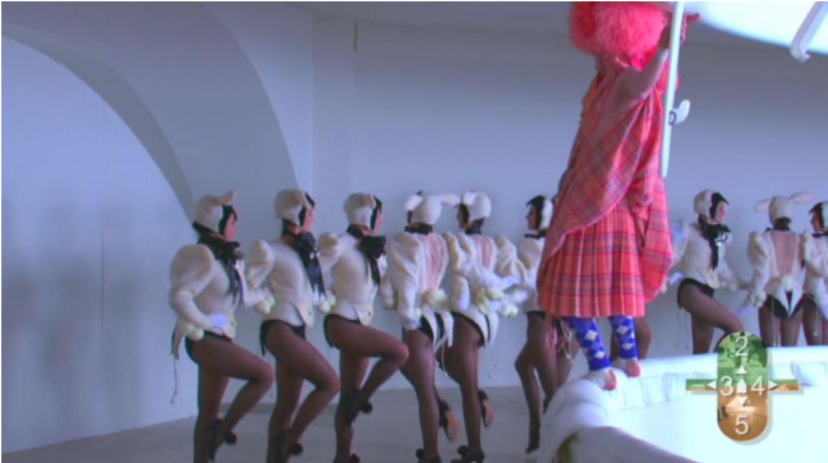
Illustration 5: Interactive version marked by the field symbol. Screenshot from: Barney, Matthew. "The Order." Cremaster 3. © Matthew Barney

hand corner of the screen after the different 'degrees' are presented, functioning as a virtual button.