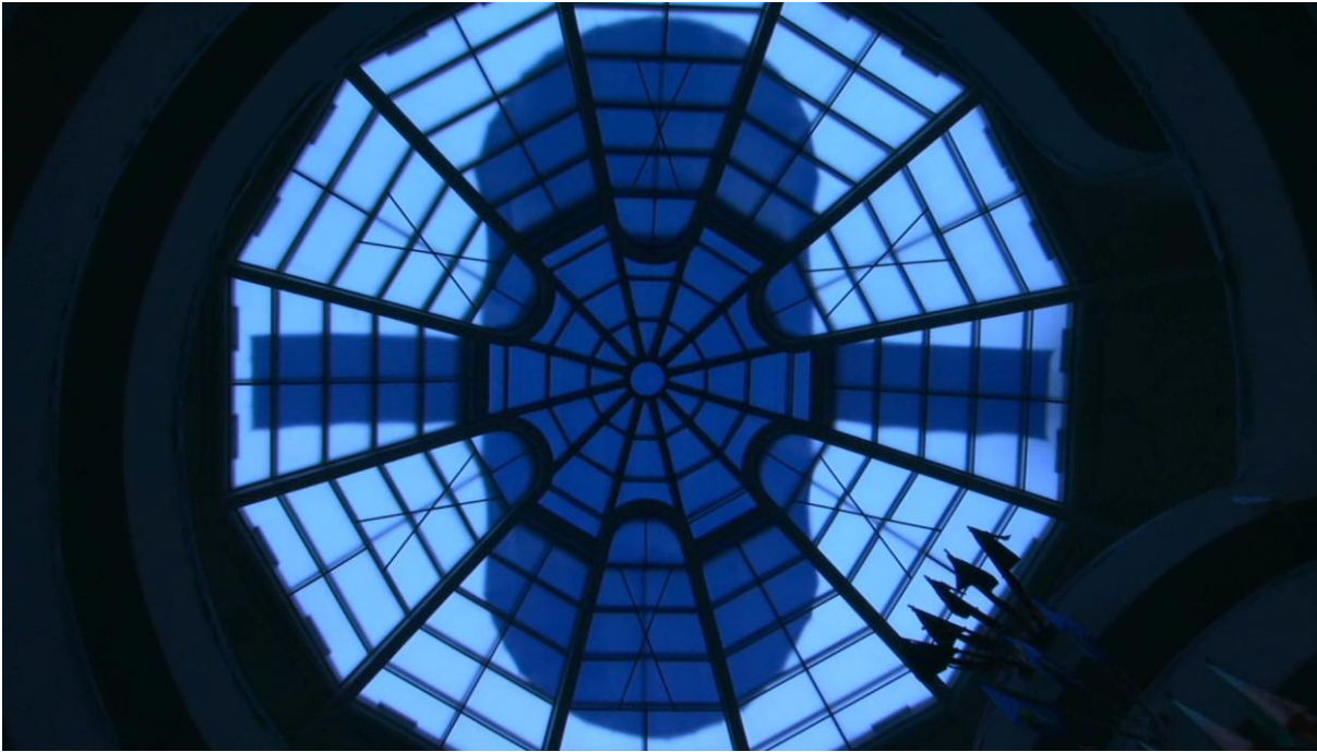
Illustration 6: Final shot. Screenshot from: Barney, Matthew. "The Order." Cremaster 3.

Guggenheim's ceiling on which Barney's field symbol is projected, drawing closer to the circle in its centre.