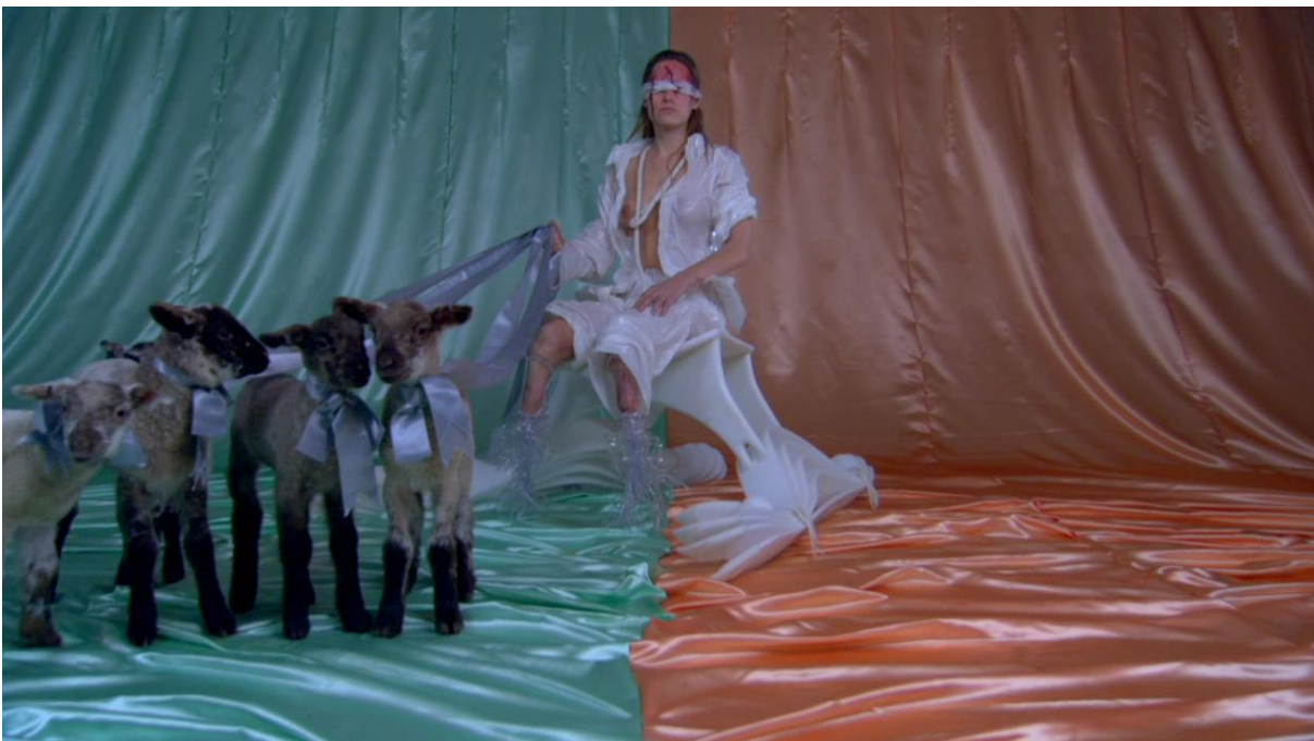
Illustration 3: Frozen image of Aimee Mullins. Screenshot from: Barney, Matthew. "The Order." Cremaster 3.

That being said about the general framework of "The Order," what is at stake in Barney's film is clearly also a question of the aesthetic order going along with the violent system expelling its Other. In the shot following the killing-scene, that is, after her death as becoming ani/omalous, or, in other words, as an embodiment of a Deleuzian conception of art [9] , we see Aimee Mullins frozen into a fixed image.