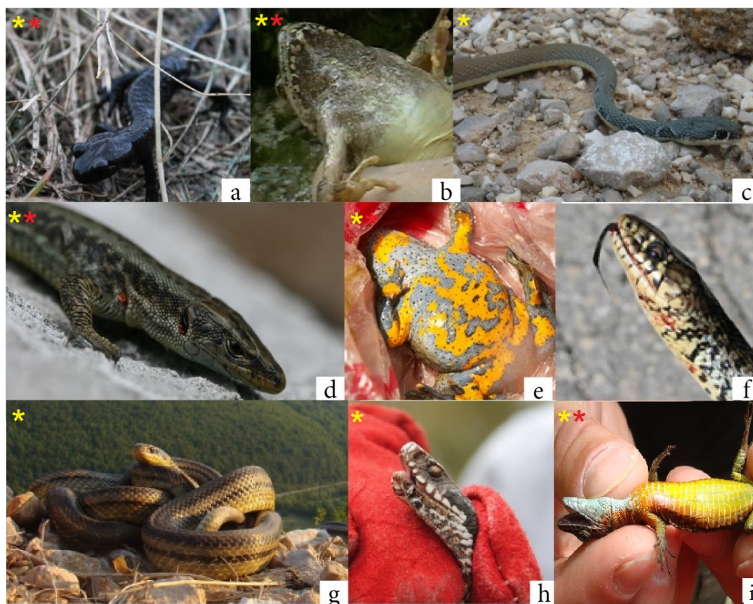
Figure 3. Photographs of some rare, NATURA 2000 species (📍) and species from the local Red List (*): a) S. atra prenjenensis ; b) R. graeca ; c) P. najadum dahlii ; d) D. mosorensis ; e) B. variegata ; f) H. gemonensis (the northernmost finding); g) E. quatuorlineata ; h) V. berus bosniensis ; i) A. nigropunctatus .

Slika 2. Broj literaturnih i terenskih nalaza s istraživanog područja u period od 141 godine.