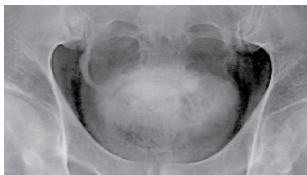
Fig. 2. Cystogram phase of intravenous pyelography showing a long coiled tube without urethral extension.

symptoms. His behavior gave no indication of psychiatric illness, drug abuse or erotic stimulation intent. The self-made catheter slid up the urethra and coiled itself in the bladder. Complete examination was performed, followed by intravenous pyelography and mycturition cystourethrography (Fig. 2). There was no evidence for intravesical calculus. No significant pathologic results were found except for the foreign body and urethral stricture of 2 cm in length. A permanent catheter was placed to allow urine flow until the procedure. Urethroscopy was done with a 22.5 cm cystoscopic sheath and 12 degree scope. The patient had a stricture in the bulbomembranous part of the urethra. Internal urethrotomy using Sachse knife was then performed, followed by cystoscopy. The stricture itself was of rigid consistency resembling cartilage. A piece of silicone insulation approximately 30 cm long was located inside the urinary bladder (Fig. 3). No in-