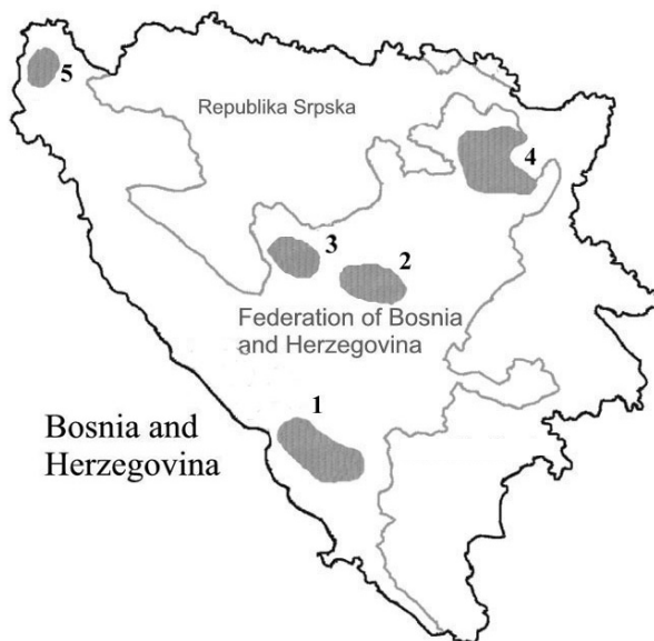
Figure 1. Regions in Federation of B&H where milk iodine was investigated in the study

Approximately 20 mL of each samples was collected, packed into plastic bottles and stored at -22\text{ }^{\circ}\text{C} with no preservative added. The frozen milk samples were sent from Veterinary Faculty - Sarajevo (B&H) to the Swiss Federal Office of Public Health for the inductively coupled plasma mass spectrometry (ICP-MS) measurement of iodine content.