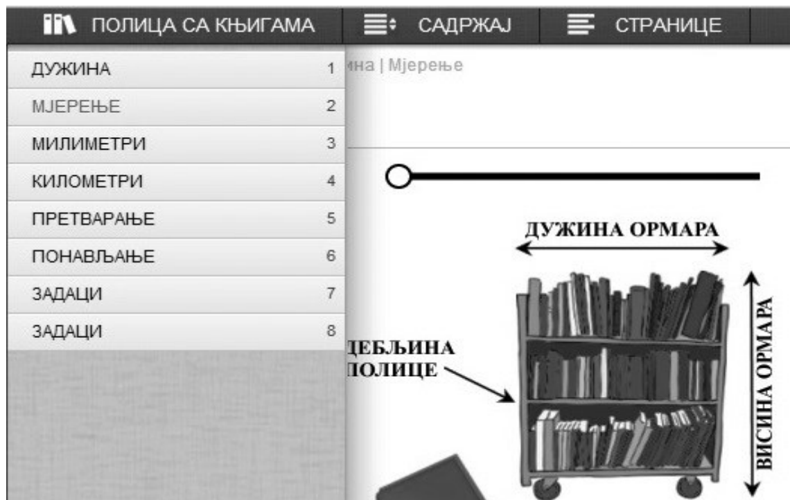
Figure 3. The coherence of content.

The structure of the lessons should be spatial and visual-graphic labeled in a clear manner and consistently implemented throughout the entire book. Lesson in a traditional textbook is displayed in a simple manner. In contrast to this, the lesson of the electronic textbook is rich with images, animations, interactive questions and tasks with feedback, and didactic games