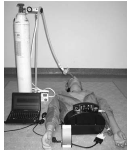
Figure 1. Study model for evaluation of air leak during ventilation and cardiopulmonary resuscitation (CPR): 1. Ambu Cardiac Care manikin, 2. Medumat Easy respirator, 3. Analog-cyber transducer, 4. Notebook with Ambu CPR SOFTWARE.

After successful airway management, mechanical ventilation was commenced with the respirator Medumat Easy (Weinmann, Germany). Using the program AMBU® CPR SOFTWARE, minute ventilation with ET or LMA Supreme was measured during continuing chest compressions for 2 minutes. For evaluation of effectiveness of ventilation we used a research model consisting of AmbuMegaCode Man manikin system connected to the computer (figure 1). The air leak during CPR for each airway device was counted using the following formula: PM_x = 1 - (\sum_{i=1}^n PV_x) PV_c^{-1} [\%] , where: PM_x – air leak, PV_x – mea-