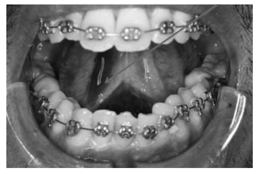
Figure 2. Sublingual haematoma.