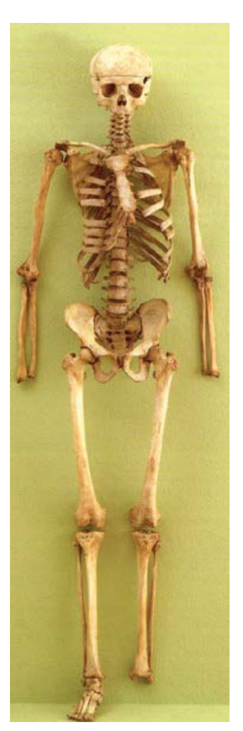
Figure 6 - Also while in Basel, Vesalius assembled this human skeleton (1543), which can be seen today in the University's Anatomical Museum.

Slika 6. Dok je boravio u Baselu, Vesalius je sklopio ovaj ljudski kostur (1543.), koji je danas izložen u Anatomskom muzeju sveučilišta.