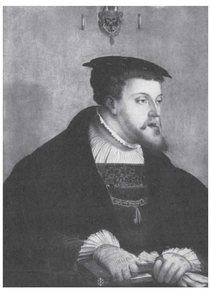
Figure 8 - Emperor Charles V. Portrait by Chistoph Amberger, 1532, showing the pronounced prognathism, open mouth, and enlarged under lip. (CJ. Gedanken Uber Karl V. Munich: Hermann Rinn, 1950, p. 20)

Slika 8. Car Karlo V. Portret Christopha Ambergera iz 1532., prikazuje izraženi prognatizam, otvorena usta i povećanu gornju usnu. (CJ. Gedanken Uber Karl V. Munich: Hermann Rinn, 1950., str. 20)