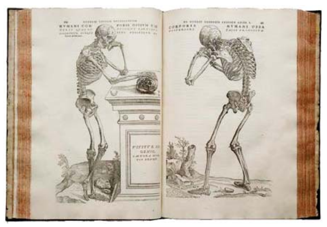
Figure 4 - Fabrica, pp. 164 and 165. Slika 4. Fabrica, str. 164 i 165.

that the Greek anatomist had never dissected human beings but had extrapolated to people from his finding in pigs and Barbary apes. This indictment of Galen angered Sylvius and other anatomists, who revered Galen and extolled his writings as sacrosanct. Sylvius argued that deviations from Galenic anatomy noted by Vesalius were possibly due to the human body having changed over the 1300 years since Galen's time. 14 Sylvius also disparaged the many woodcuts in De fabrica , arguing that anatomical illustrations are a poor substitute for working at the dissecting table -- thus being oblivious to his own blindness there. Years later Sylvius ridiculed Vesalius via a Latin pun on his name when he wrote about "the calumnies of a certain madman" (Vaesani cuiusdam calumniarum).<sup>15</sup>