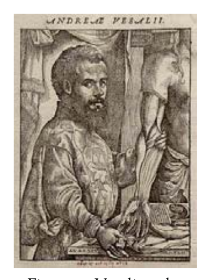
Figure 3 - Vesalius, the only authentic portrait (Fabrica, 1543) Slika 3. Vesalius, jedini autentični portret (Fabrica,