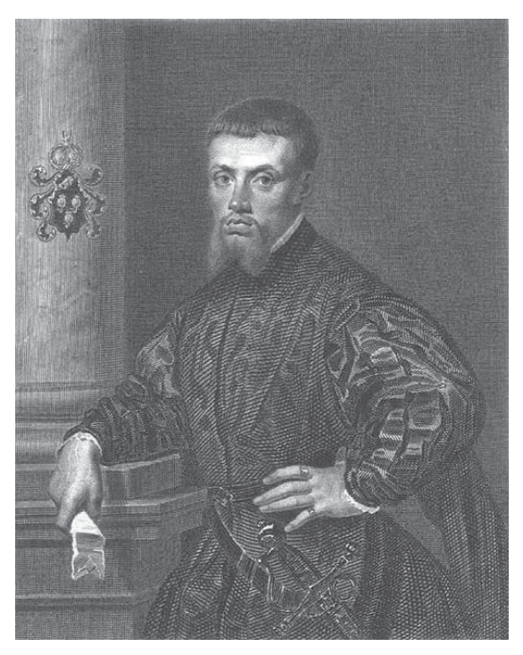
Figure 1 - Engraving from a picture by Tintoretto of Andreas Vesalius about 1540.

Slika 1. Gravura Tintorettove slike Andreasa Vesaliusa, oko 1540.