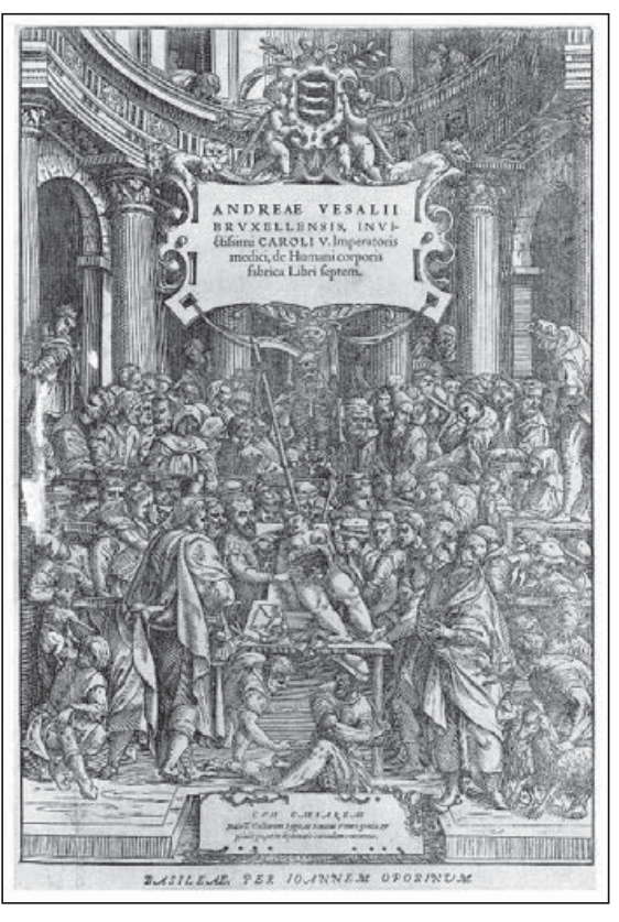
Figure 2 - Frontispiece ANDREAE VESALII BRUXELLENSIS, INVICTISSIMI CAROLI V. Imperatoris medici, de humani corporis fabrica libri septem. (Basileae, per Ioannem Oporinum)

During his five years in Padua, Vesalius' compiled a massive new anatomy, which was completed in 1542 when he was age 28. He spent six months of 1543 in Basel at the shop of Joannes Oporinus (1507-1568), overseeing the printing of De Fabrica with its 278 anatomical woodcuts and a polished, prolix Latin text – yielding a total of 716 pages. 12 This was too large and expensive a book for the ordinary student or physician. So Vesalius published at the same time an abridged version, the Epitome, which contained o large anatomical woodcuts (20" x 14") but only II pages of text. It's not known now how many of the drawing in the two 1543 volumes were by John Stephen.<sup>13</sup>