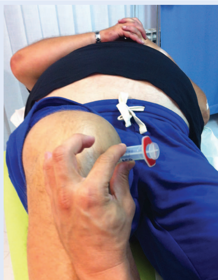
Figure 4. The application of PRP into the knee joint.

Muscle injuries are a result of a single direct trauma or eccentric load applied on the muscle in contraction. These trauma mechanisms cause different injuries and they vary from contusion with unharmed integrity of the muscle to smaller or bigger tears of the muscle. In most cases skeletal muscle injuries in athletes involve hamstrings, quadriceps and gastrocnemius. All these injuries can keep an athlete away from training and competition rhythm for a couple of weeks. This is a major problem of professional sport, where all possible efforts along with technological achievements are invested in order to reduce the number of injuries in professional athletes. However, if an injury occurs, all efforts are taken to reduce the recovery and healing time. Recovery has to be instant and complete within only a brief period of time away from training and competing. As all other tissues, muscles heal through