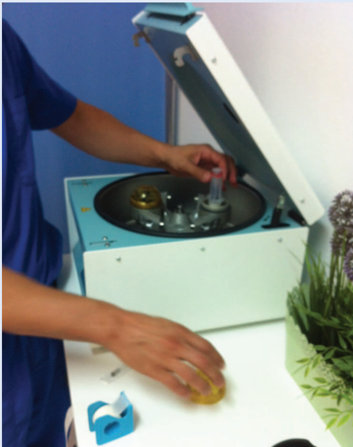
Figure 2. The syringe with venous blood is placed in centrifuge at 1500 rpm for 5 minutes