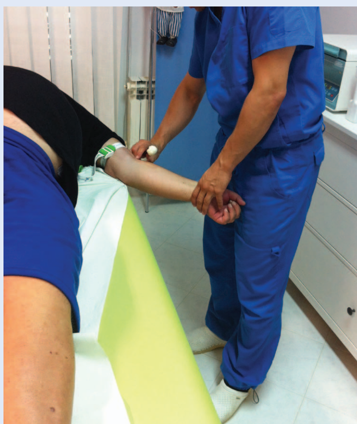
Figure 1. The preparation of the patient for drawing venous blood; 10 cc of venous blood is necessary for the preparation of platelet rich plasma (PRP).

verse proportion of a regular blood sample. The question of leukocyte concentration is still a matter of discussion and should also be further investigated. The growth factors that are released from activated platelets include various factors, such as the transforming growth factor (TGF- \beta ), platelet-derived growth factors (PDGF-AB and PDGF-BB), the insulin-like growth factor (IGF), vascular endothelial growth factors (VEGFs), epidermal growth factors (EGFs) and the fibroblast growth factor (FGF) 21-23 . TGF- \beta 1 and PDGF appear to be two most important mediators that provoke proliferation of mesenchymal cells and in the end lead to the formation of a new connective tissue, leaving a cicatrix. While PDGF is important in the early stages of healing, TGF- \beta 1 is significant for production of collagen in the extracellular space and in the later phases of healing 24 . VEGF and FGF-2 are, among other factors, important mediators that play a key role in revascularization of the newly formed connective tissue.