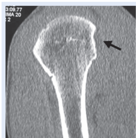
Figure 2. MRI showing the defect on the humeral head (Hill Sachs lesion)