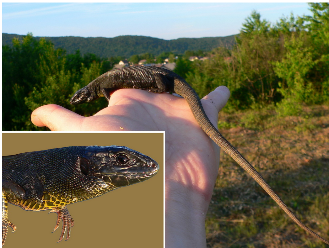
Figure 2. The melanistic Lacerta viridis . Lighter coloured ventral scales is visible here. Slika 2. Melanistični obični zelembač Lacerta viridis . Vidljive su svjetlije ventralne ljuske.