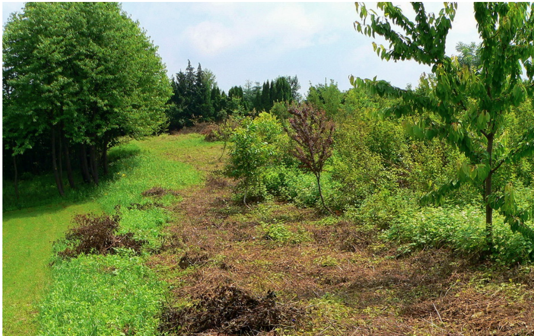
Figure 1. Location in which a melanistic L. viridis was recorded, and the habitat type at this location. Slika 1. Lokacija nalazišta melanističkog L. viridis u Hrvatskoj i tip staništa na nalazištu.