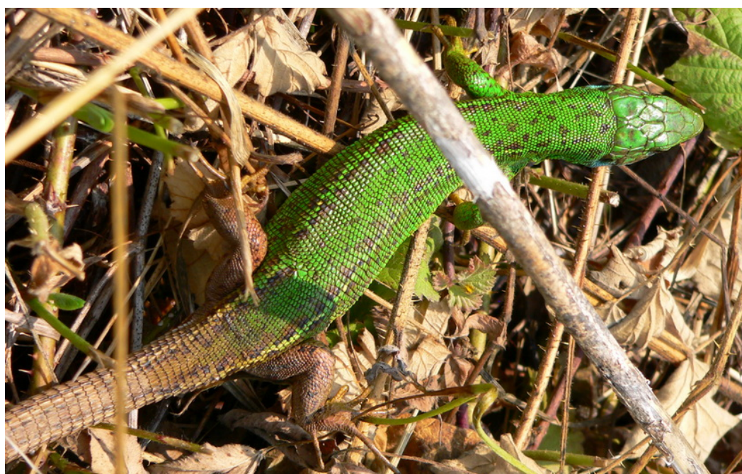
Figure 3. Normally-coloured L. viridis from the same locality. Slika 3. Uobičajeno obojeno obični zelembač L. viridis s istog lokaliteta.