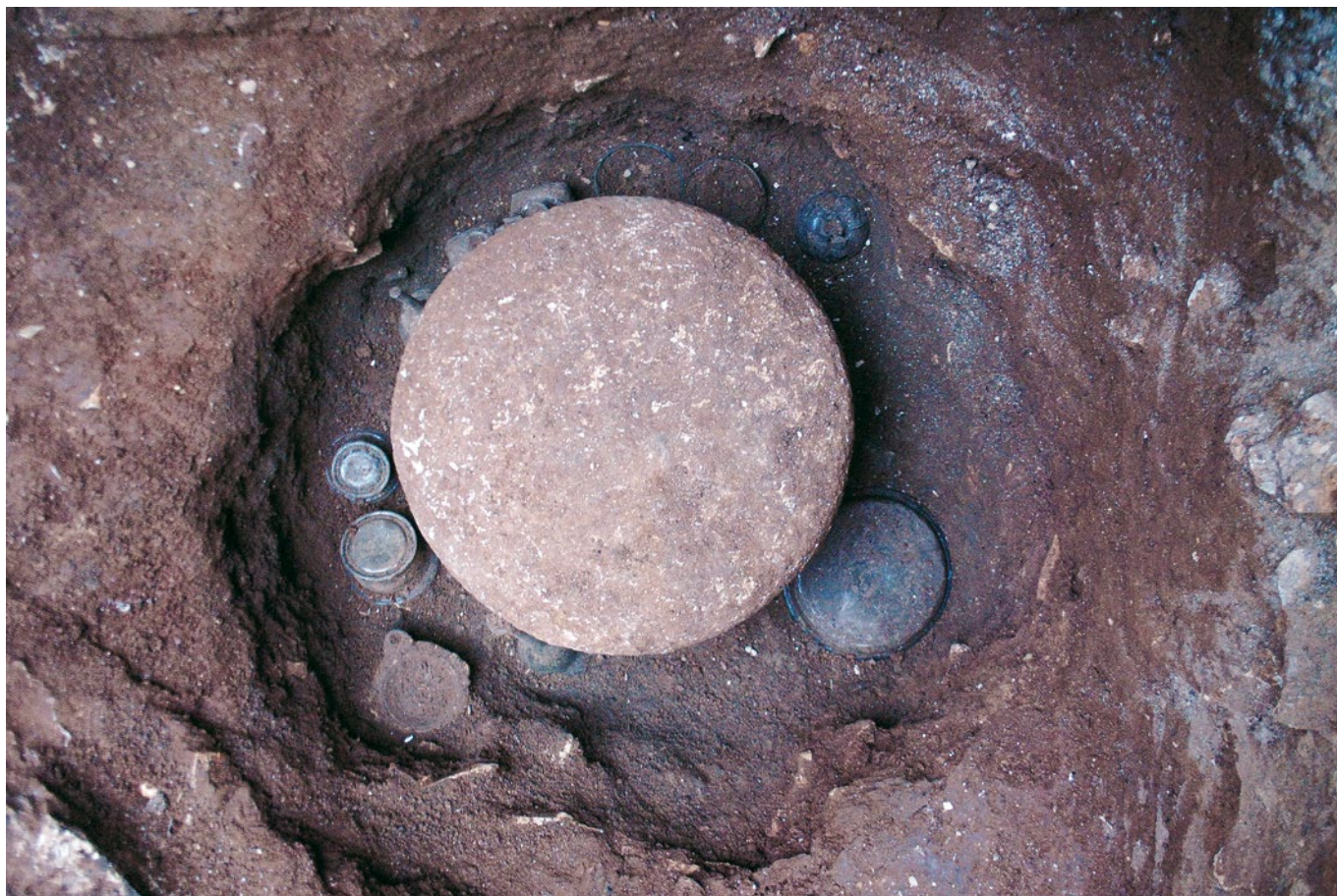
Sl. 4. / FIG. 4.