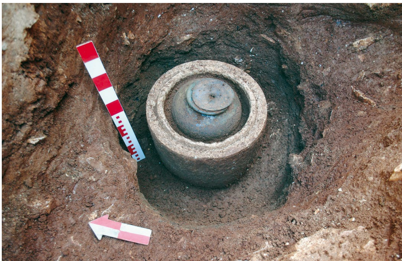
Sl. 5. / FIG. 5.