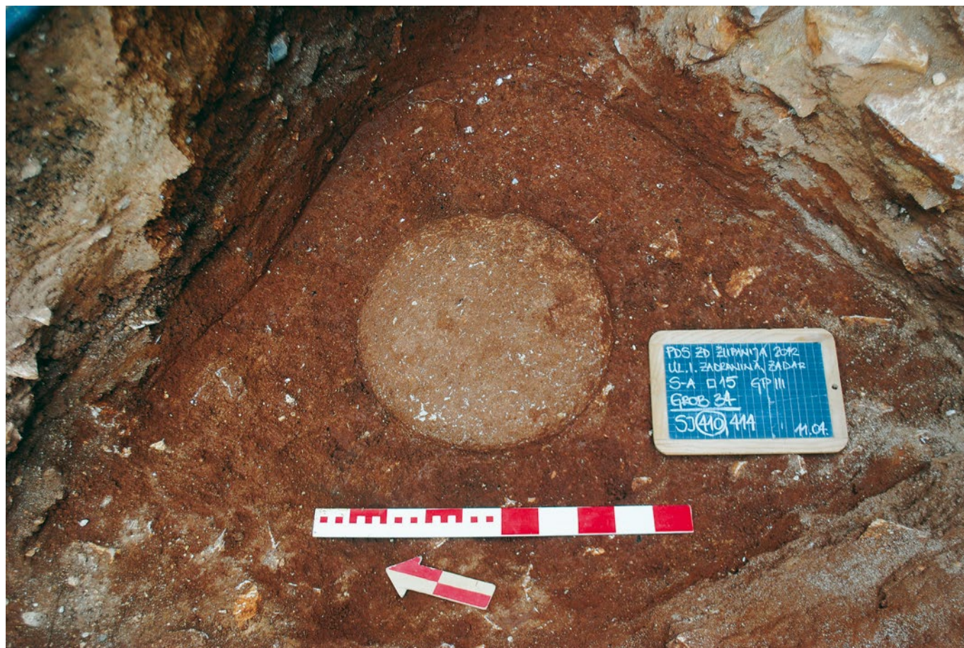
Sl. 2. / FIG. 2.