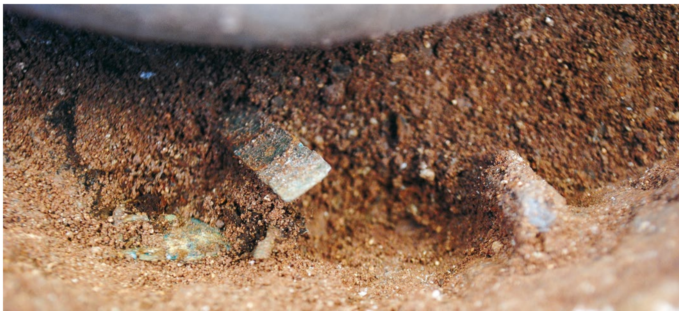
Sl. 7. / FIG. 7.