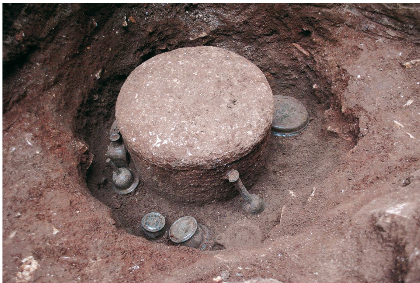
Sl. 3. / FIG. 3.