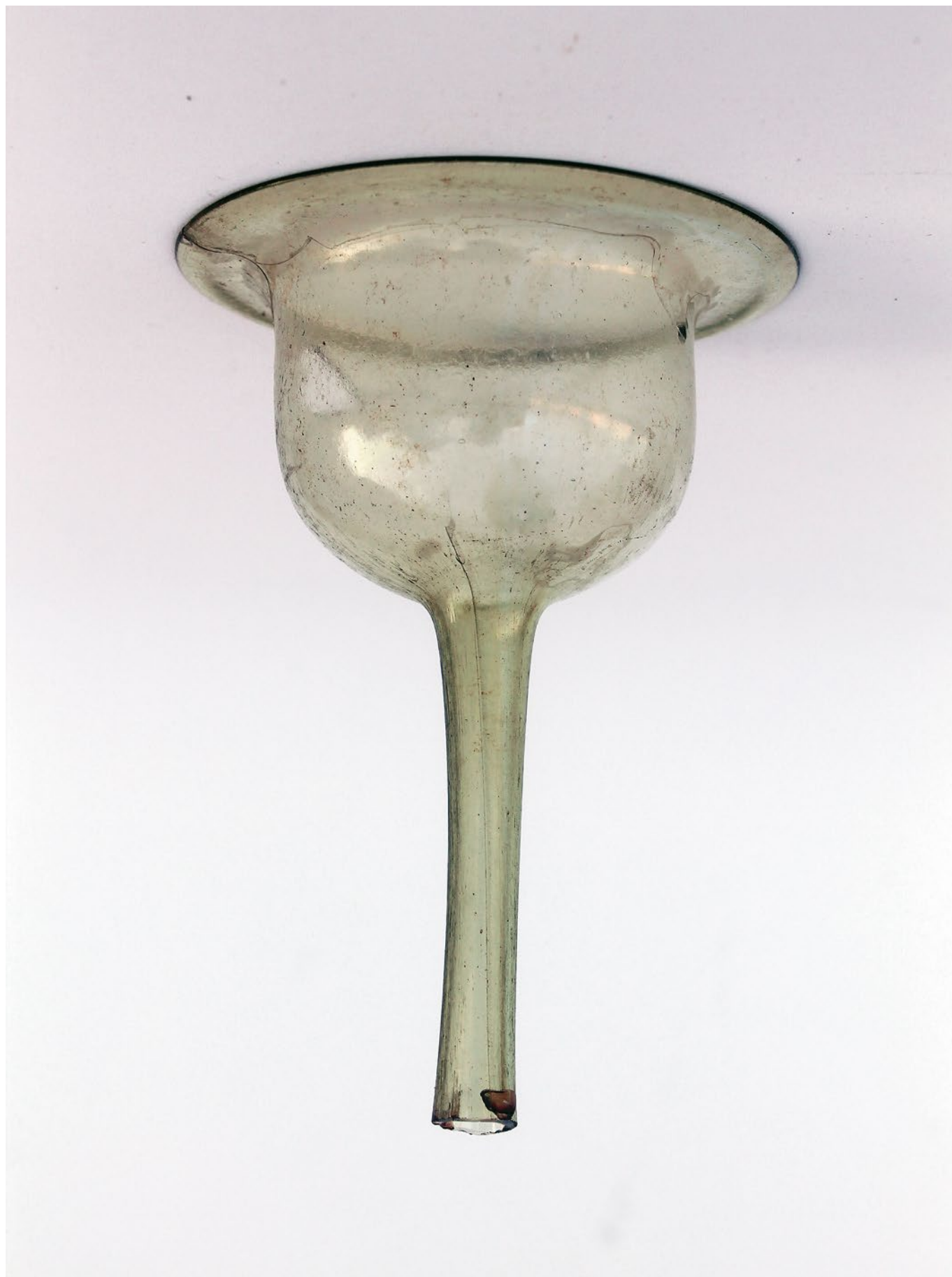
SL. 9. / FIG. 9.

Lijevak pronađen u grobu 34 u Ulici fra Ivana Zadrana u Zadru.