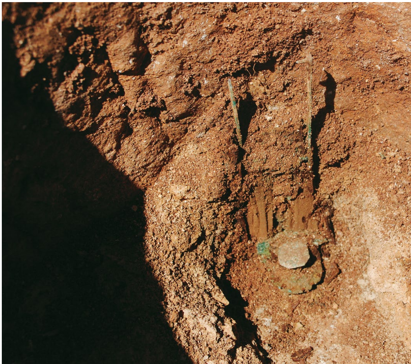
Sl. 8. / FIG. 8.