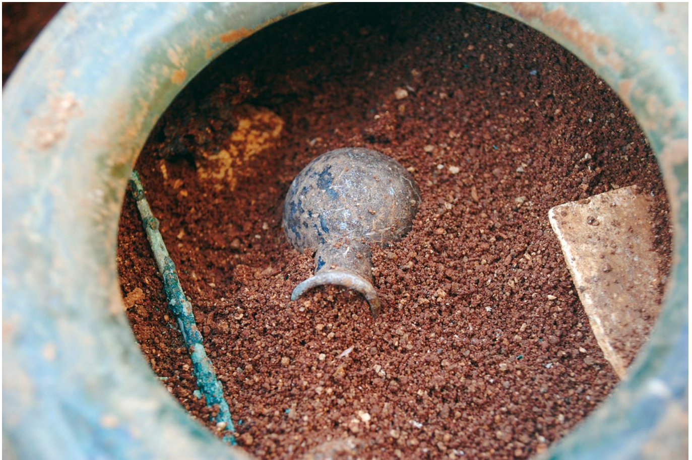
SL. 6. / FIG. 6.

lum) sa zadarskog područja (Sl. 10). Uz novi lijevak iz groba 34 u Ulici fra Ivana Zadrana, od prijašnjih nalaza u objavi iz 2006. godine pro-makao je još jedan infundibulum iz groba 181 na Trgovačkom centru u Zadru. 4 Dakle, četiri do sada poznata staklena infundibula potječu upravo iz Zadra, a otkriveni su u arheološkim istraživanjima antičke nekropole Jadera na lokalitetu "T. C. Relja" 2005. godine. Pronađeni su u paljevinskim grobovi-ma br. 35, 125, 171 i 181. 5 Ostala dva su u vihoru Drugog svjetskog rata, 1944. godine, odnesena iz Zadra u Italiju i danas se čuvaju u Muzeju stakla u Muranu. 6 Provenijencija im nije posve sigurna pa se kao mjesta nalaza navode Zadar, Nin ili Aserija (Podgrađe kod Benkovca), mada je veoma vjerojatno da su i oni s antičke nekropole Jadera. U svakom slučaju, oni su sa zadarskog područja.