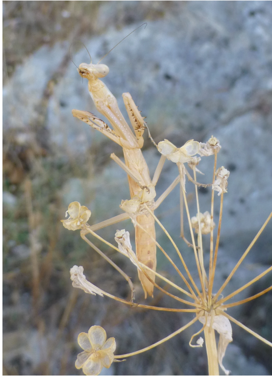
Fig. 2. Mediterranean Mantis Iris oratoria from Kucište, Pelješac Peninsula

tion (3 subadult females and 1 subadult male) were swept in tall grasslands along the road between Perna camp and Liberan on 3 August 2013 and 8 August 2013.