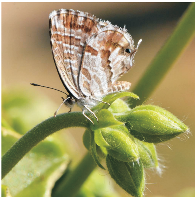
Figure 1. Cacyreus marshalli , adult on inflorescence of Pelargonium sp. (photo S. Janeković).

The butterfly Cacyreus marshalli (Fig. 1) is naturally widespread in Mozambique, South Africa, Zambia and Zimbabwe (Heaths et al. 2002). This species from the family Lycaenidae was introduced to Europe from South Africa in the second half of the twentieth century. The first record was of a caterpillar found in England in 1978 (Heaths et al. 2002). Geranium Bronze was recorded in Mallorca in 1990, in Italy in 1996, in Morocco, Portugal and the French Mediterranean in 1998, in Sicily in 2001, in southern Switzerland in 2002, in Slovenia in 2008 and in Croatia in 2009 (Kosmač & Verovnik, 2009; Tolman & Lewington, 2009; Verovnik et al., 2011; Kučinić et al., 2013). This species was also established in Belgium, Germany, the Netherlands and the United Kingdom but was unable to survive the winter (Gross, 2010). Larval host plants are species from the genera Pelargonium and Geranium (Tolman & Lewington, 2009). Since its accidental introduction to Europe, due to its biological and ecological features, the Geranium Bronze has spread to the south and southeastern parts of Europe (Tarrier, 1998; Aistleitner, 2002; Aistleitner & Pollini, 2004). In Croatia this species was first recorded in Mali Lošinj (Kosmač & Verovnik, 2009). Data about the spread of the species is given by Kučinić et al. (2013). Recently C. marshalli was recorded on the Island of Hvar (Koren et al., 2014), which is now the southernmost point of its distribution area.