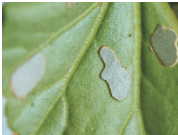
Figure 2. Specific damage to plants on the bottom side of the leaf of Pelargonium peltatum caused by caterpillars of Cacyreus marshalli (foto M. Randić).

In this paper we present: 1. New findings and distribution of species C. marshalli in Croatia, 2. Data about host plants, damage to host plants and flight periods of adults (ethology data).