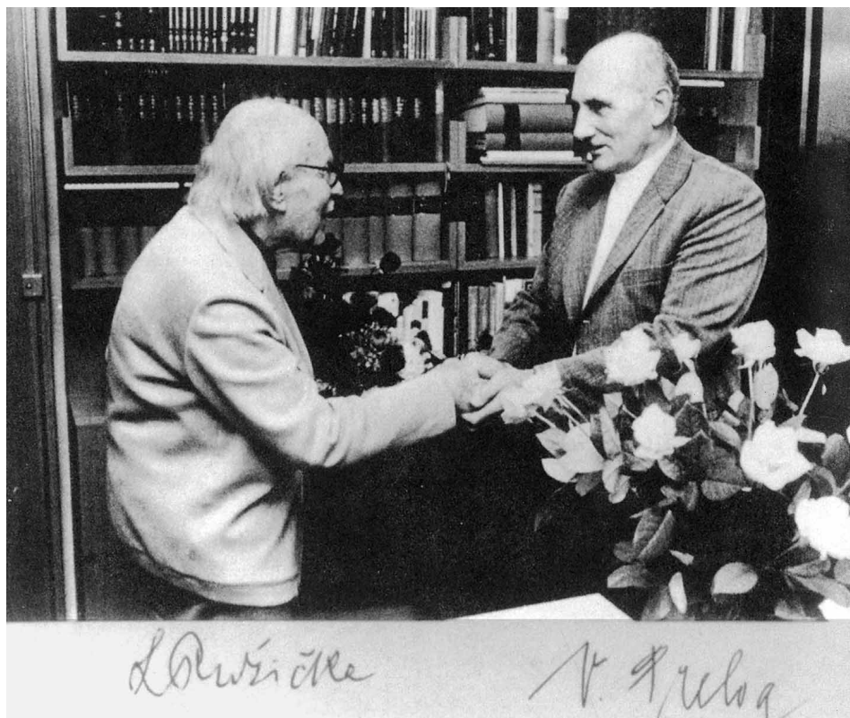
Figure 3. Professor Ružička congratulating Vlado Prelog on the latter's Nobel Prize in 1975. Professor Ružička's own Nobel Prize was in 1939.