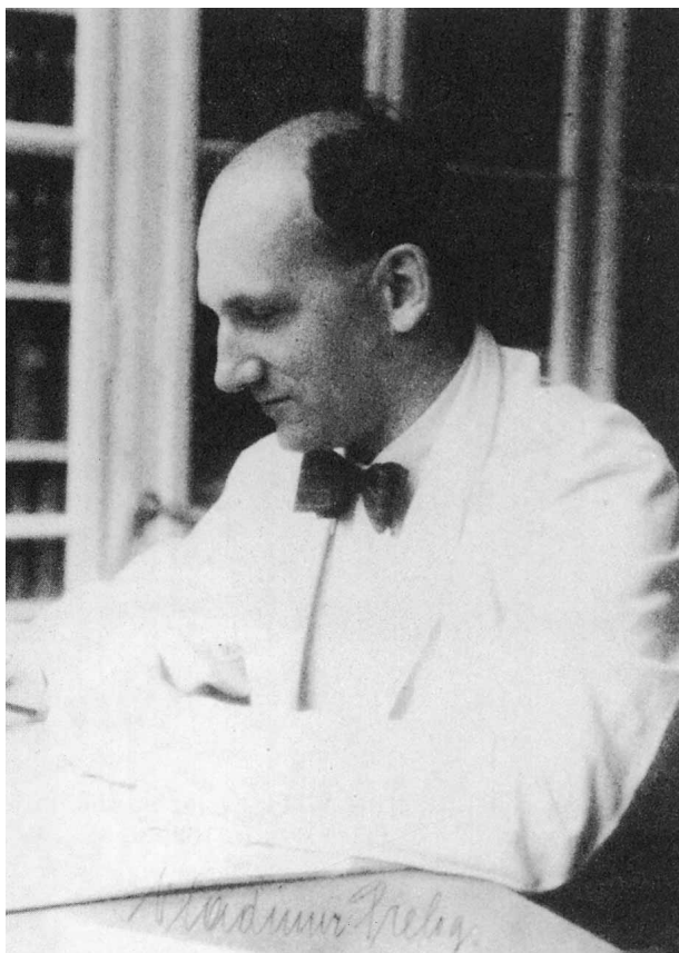
Figure 2. V. Prelog in his office at the Organisches Laboratorium ETH – July 1949.

on his round, Professor Prelog came to my bench with a report of analyses in his hand and said »Dr. Khorana, another disastrous day... But you know, I tell myself – I cannot keep going down any more so I must go up.«