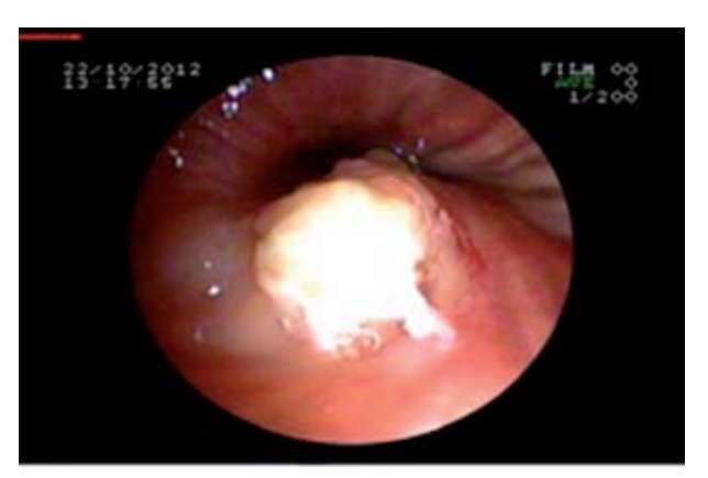
Fig. 3. Endobronchial polypoid lesion covered with necrotic tissue in the intermediary bronchus.

computed tomography (CT) showed a big cavity in the lower right lobe (Fig. 2). Also, there were multiple nodular opacities in both lung parenchymas on CT. In her bronchoscopic evaluation, the upper right lobe and segment ends were open. In the intermediary bronchus, there was an endobronchial polypoid lesion covered with a white necrotic material that obstructed the passing of the bronchoscope (Fig. 3). Bronchial lavage ARB and mycobacterium cultures were negative. The result of endobronchial lesion biopsy was reported as squamous epithelial cell carcinoma. In the case which was assessed with tongue biopsy speci-