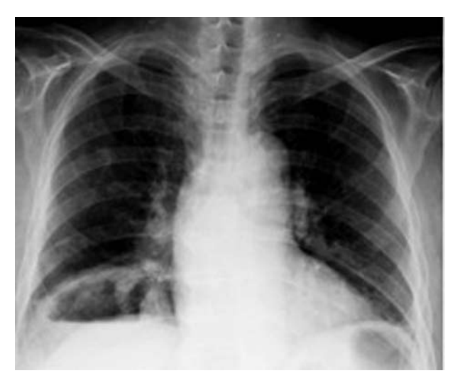
Fig. 1. Posteroanterior chest radiography: cavity in the lower right zone.

not smoke. Her physical examination showed that her general condition was good, she was conscious, her cooperation and orientation were intact, and she had an operation scar on the tongue. Examination of the respiratory system revealed the presence of inspiratory rales in the right lung. There were no abnormalities in the results of routine blood tests, except for elevated erythrocyte sedimentation rate (ESR) and C-reactive protein (CRP) values (ESR 65 mm/h, CRP 5.42 mg/dL). Her rheumatoid markers were negative. A cavity was observed in the lower right zone on posteroanterior chest radiography (Fig. 1). Her thoracic